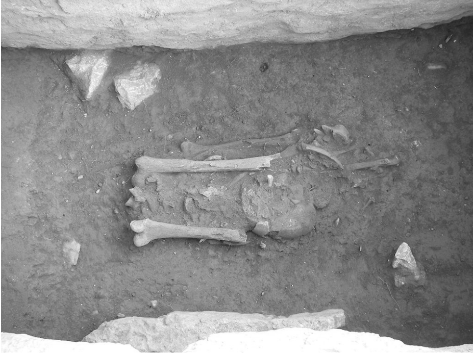
Fig. 6: A carefully placed secondary burial on the floor of cist grave L459 (after authors).

Zavvou 2010: 89). In this case, it seems more likely that the intricate rearrangement of human remains was part of complex, ongoing mortuary practices at the site of the grave. This impression is corroborated by comparable evidence from pit L224 (see below).