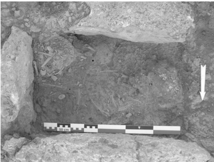
Fig. 9: A primary (center and right) and a secondary (upper left) infant burial in cist grave L200 (after authors).