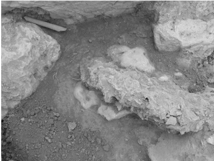
Fig. 12: Spine in articulation in secondary burial L152 (after authors).

Estimating time since death based on the state of body decomposition is one of the most complex undertakings in forensic anthropology as it depends on a number of intrinsic and extrinsic factors, such as the circumstances of burial (e.g. open-air, earth-covered or placed in a container), its depth and exposure to organisms accelerating decomposition, temperature and moisture fluctuations, the amount of fat available on the body at death, and the presence of disease (Ferreira & Cuhna 2013). Although a buried corpse may start decomposing only weeks after burial in a temperate environment (Duday & Guillon 2006: 127), a number of possible factors affecting decomposition speed compels us to postulate a period of few months to a few years elapsed between the first interment and the secondary deposition (Galloway 1997; Bass 1997). The absence of other articulated remains in L402 may be due to the transportation of body parts and skeletal segments from burials in varying states of decomposition.