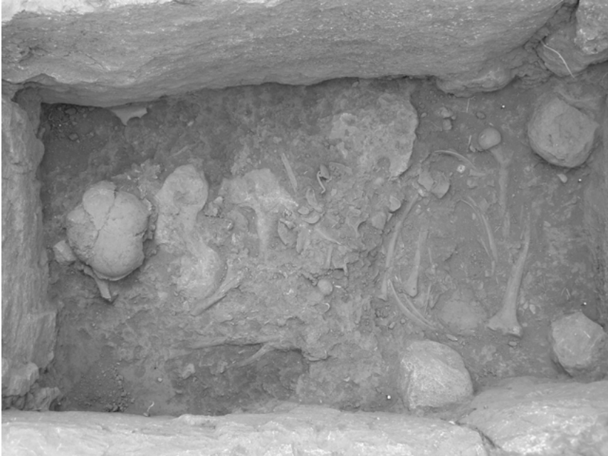
Fig. 3: Cist grave L150: the commingled remains of the 'middle layer' (left) and the osteotheke (right) (after authors).