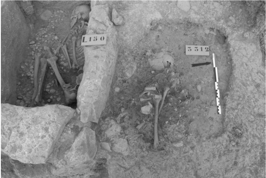
Fig. 2: Secondary burial L152 and cist grave L150 with the articulated skeleton on its upper layer (after authors).