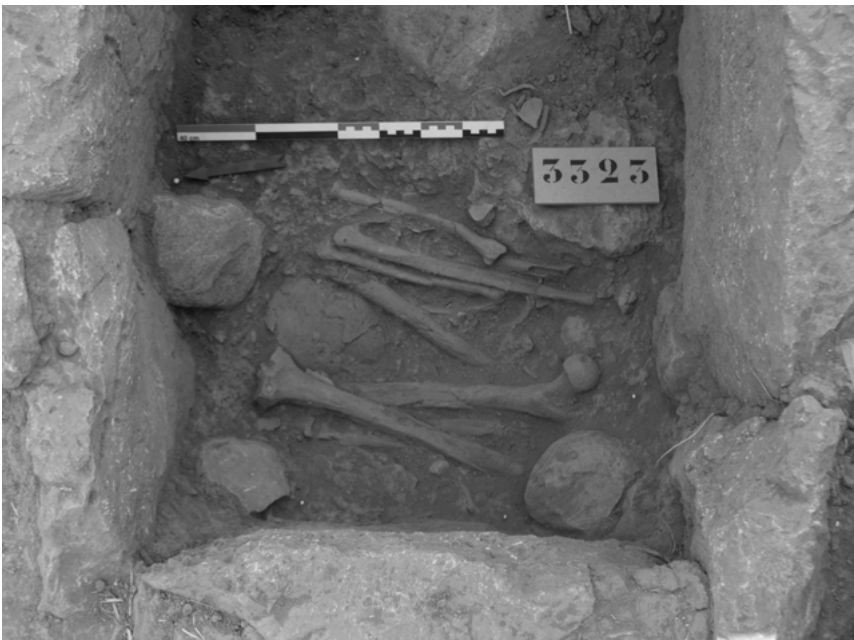
Fig. 4: Cist grave L150: a closer view of the osteotheke (after authors).