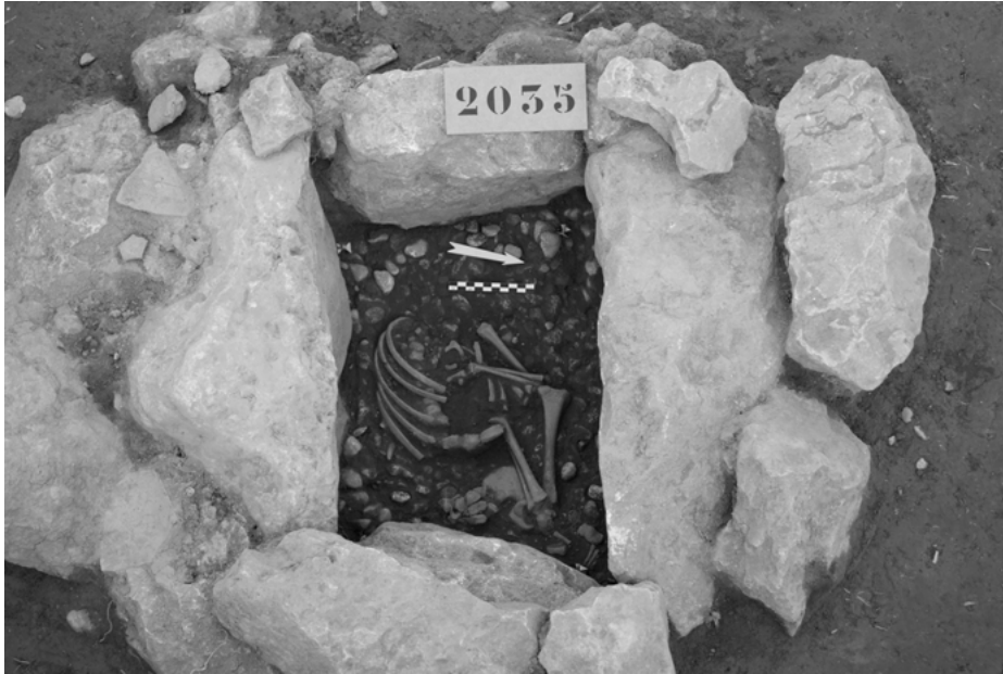
Fig. 7: The cist grave of a child (L402) (after authors).

L200, a larger than the previous stone cist grave ( 0.87 \times 0.58 m), contained the primary and secondary burials of two infants: the skull and postcranial skeleton of one infant was piled on the east part of the cist along the feet of another infant flexed on the right side [Fig. 9]. The stratigraphic position of the former in relation to the articulated infant suggests that their placement took place simultaneously. The practice of placing the secondary burial of an infant together with the primary interment of another infant is also known from cist and built graves from Malthi (Valmin 1938, graves XXXVI, XL, XVIII) and one possible case from Ayios Vasilios (grave 24, Moutafi & Voutsaki 2016). In this site, grave furnishing suggested that the first interment that was constructed in the Middle Helladic was pushed to the side to accommodate a second interment of the same (Middle Helladic) or later (Late Helladic) period. Infant bones heaped in one side of the grave are also known from past excavations at Kirrha (Dor et al. 1960, grave 50), Eleusis (Mylonas 1975, grave Δπ4), and Agios Stefanos (Taylour & Janko 2008: 125, grave 12).