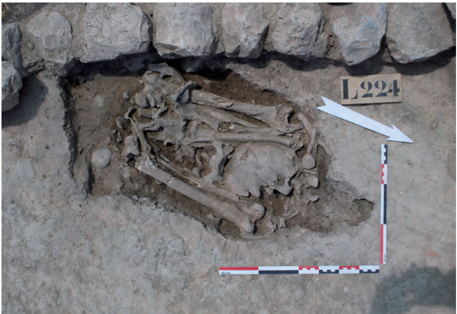
Fig. 11: Secondary burial L224 below pit L401 (after authors).