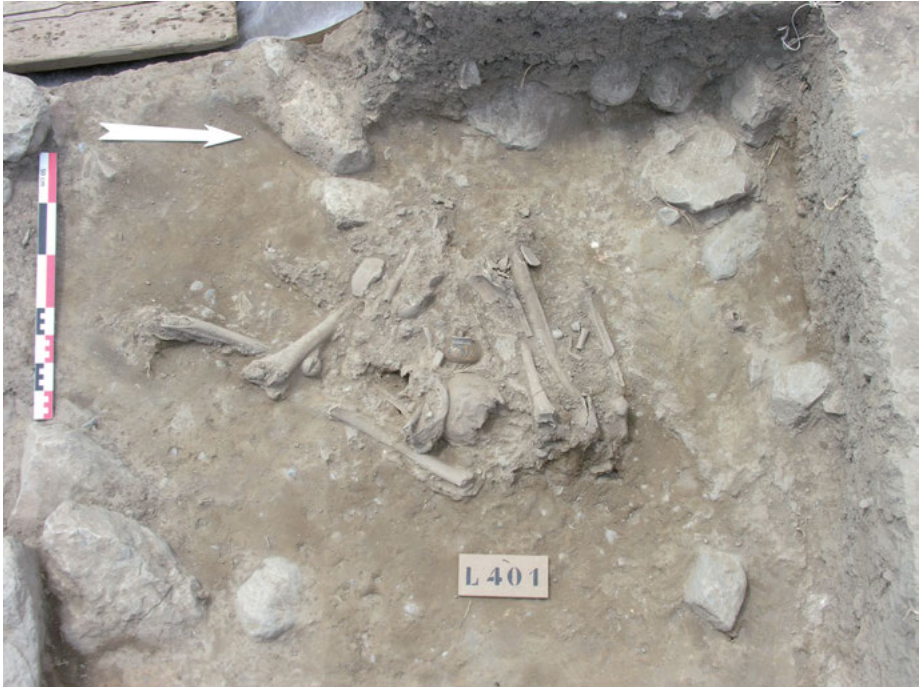
Fig. 10: Pit L401 with several adult and subadult remains and two Late Helladic I bowls (after authors).