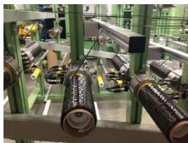
a) Carbon raw bobbin

In this study we characterize carbon T700S and E-CR glass fibers in an automated SFT equipment from Dia-Stron Ltd. Carbon fibers are extracted i) from raw bobbin, 12k procured from Toray ii) from spread sheet/tape produced on a spreading machine using the 12k bobbins and iii) from the NCF produced using the manufactured spread tape on a multi-axial machine from LIBA. Similarly, glass fibers are extracted and tested at these three stages as shown for carbon fibers in Fig. 1.