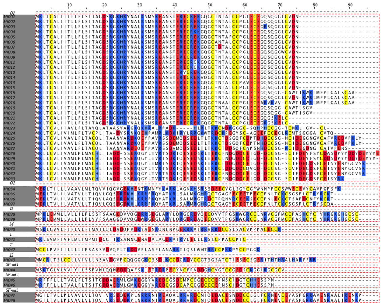
Fig. 3. Alignment of 48 conotoxin precursors. Sequences are clustered by gene superfamily according to their signal peptide, with gaps introduced to optimize alignment. Color-coding has been applied using the following scheme: cysteine residues are in yellow, negatively charged residues are in red, and positively charged residues are in blue.

used to predict the mature peptides, and the mature sequences that could be identified with an MS/MS confidence value of more than 99% are listed in Table II.