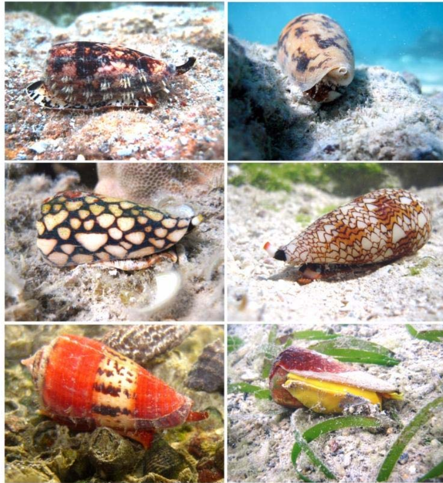
Figure 1. Live cone snails in their environment. Cone snails are marine predators that prey on worms, mollusks and fish. Upper panel shows two piscivorous species, Conus geographus (left) and Conus striatus (right). Middle section illustrates two molluscivorous species, namely Conus marmoreus (left) and Conus textile (right). Bottom panel shows two vermivorous species, Conus coccineus (left) and Conus vitulinus (right).