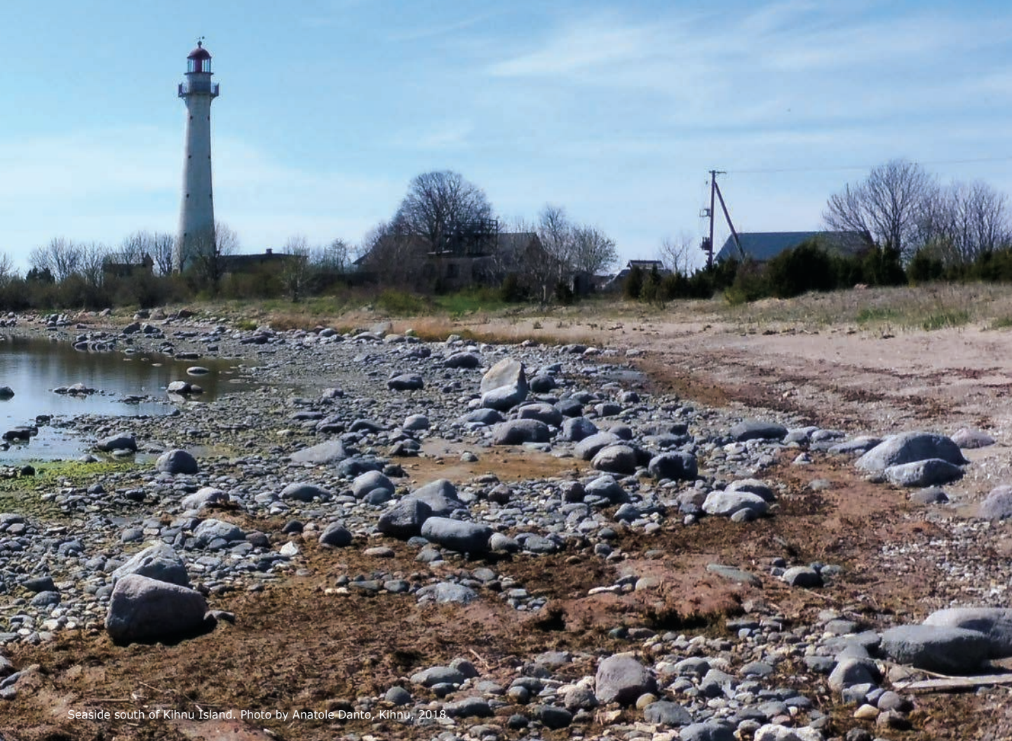
Seaside south of Kihnu Island. Photo by Anatole Danto, Kihnu, 2018.