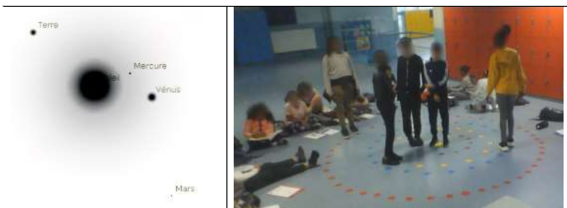
Figure 2. Initial positions of the inner planets at the date of the activity as seen on ©Stellarium (left panel; in French) and reproduced by students (middle panel, from left to right: Mars, Venus, Mercury, Sun and Earth).

The positions of the planets at the date of the day are then provided to the learners or obtained through a specific software (e.g. Stellarium©, Figure 2, left). Learners will then have to reproduce those positions on the Human Orrery (Figure 2, right). To do so, they need to search for specific geometrical configurations. Here, they reproduce the observed alignment of Earth (rightmost in the figure, blue dot), Sun and Mars (leftmost on the Figure, red dots). Some learners explicitly explained to the group that “Earth and Mars are opposite” (omitting the word Sun, that is implicit).