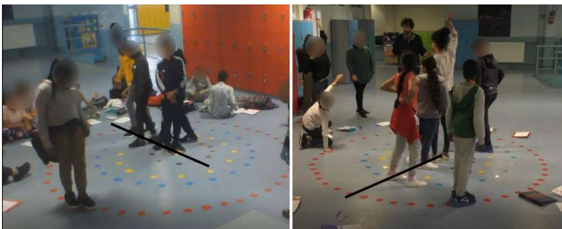
Figure 3. Left: Venus (yellow dots) overtakes Earth (blue dots). Right: Mercury (brown dots, uneasy to distinguish here) overtakes Earth. The black line highlights the alignment of the two planets with the Sun.

In many successive attempts, five learners play the role of the inner planet and the Sun while others observe. Different actors are selected each time so that all may experiment with the dance of the planets. A single instruction is given to both observers and actors: “raise your hand as soon as one planet pass by another one. Then, the actors must stop, and we will observe the respective position of the planets at that instant.” Figure 3 provides the reader with two examples of such events, involving Mercury and Earth (right), and Venus and Earth (left). The definition of overtaking was quite obvious for all. Yet, we may notice that some learners raised their hand as soon as they observed that one planet was going faster than another one.