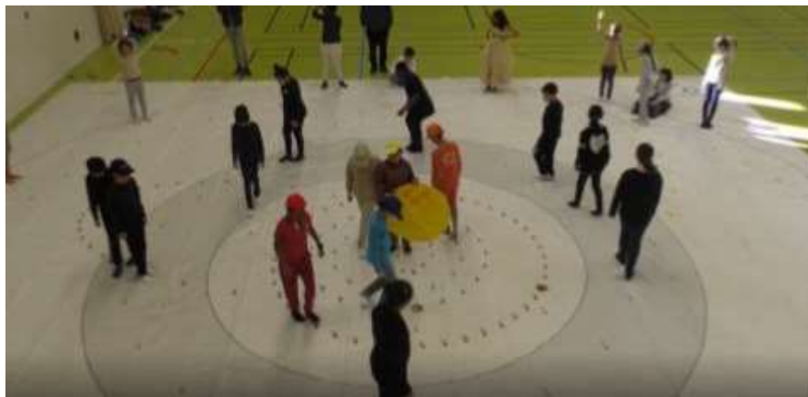
Figure 1. The “Human Orrery”: Pupils enact planets (Mercury to Jupiter), asteroids and comets (in black) along their orbits around the Sun

In this contribution, the design and operation of the Human Orrery will be shortly described, together with a short theoretical background on enaction theory. Then, a specific proposition that concerns specifically occultation phenomena will be presented.