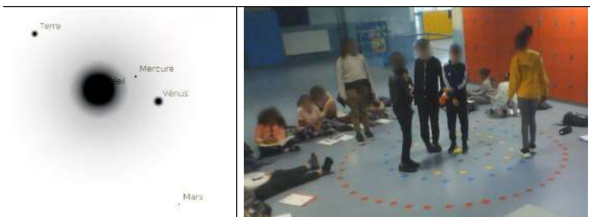
Figure 2. Initial positions of the inner planets at the date of the activity as seen on ©Stellarium (left panel; in French) and reproduced by students (middle panel, from left to right: Mars, Venus, Mercury, Sun and Earth).

The positions of the planets at the date of the day are then provided to the learners or obtained through a specific software (e.g. Stellarium©, Figure 2, left). Learners will then have to reproduce those positions on the Human Orrery (Figure 2, right). To do so, they need to search for specific geometrical configurations. Here, they reproduce the observed alignment of Earth (rightmost in the figure, blue dot), Sun and Mars (leftmost on the Figure, red dots). Some learners explicitly explained to the group that “Earth and Mars are opposite” (omitting the word Sun, that is implicit).