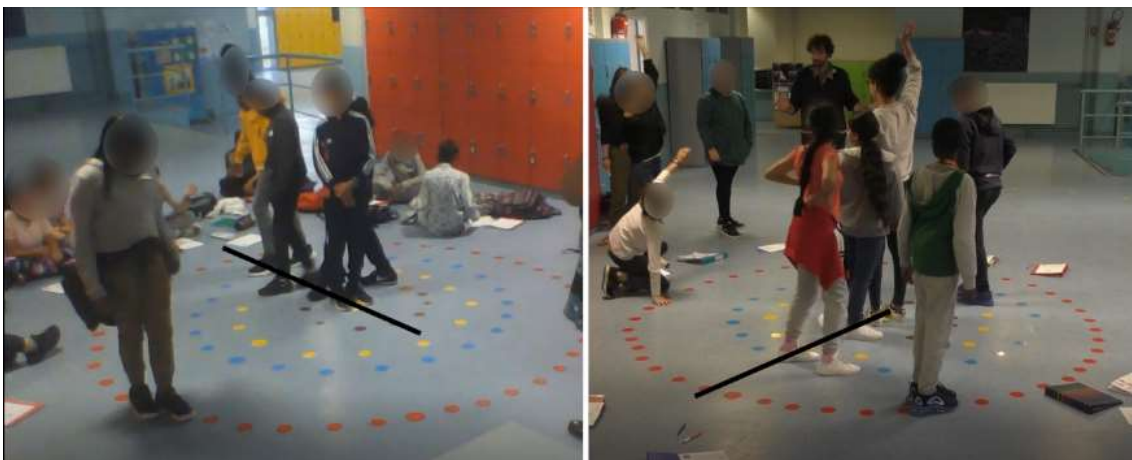
Figure 3. Examples of planets crossing each other. Left: Venus (yellow dots) takes over Earth (blue dots). Right: Mercury (brown dots, uneasy to distinguish here) takes over Earth. The black line highlights the alignment of the two planets with the Sun.

In many successive attempts, five learners play the role of the inner planet and the Sun while others observe. Different actors are selected each time so that all may experiment with the dance of the planets. A single instruction is given to both observers and actors: “raise your hand as soon as two planets cross-over. Then, the actors must stop, and we will observe the respective position of the planets at that instant.” Figure 3 provides the reader with two examples of such crossing-over, involving Mercury and Earth (right), and Venus and Earth (left). The definition of crossing-over was quite obvious for all. Yet, we may notice that some learners raised their hand as soon as they observed that one planet was going faster than another one.