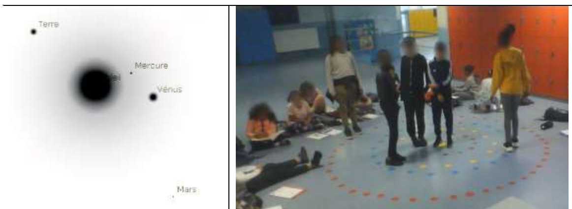
Figure 2. Initial positions of the inner planets at the date of the activity as seen on ©Stellarium (left panel; in French) and reproduced by students (middle panel, from left to right: Mars, Venus, Mercury, Sun and Earth).

The positions of the planets at the date of the day are then provided to the learners or obtained through a specific software (e.g. Stellarium©, Figure 2, left). Learners will then have to reproduce those positions on the Human Orrery (Figure 2, right). To do so, they need to search for specific geometrical configurations. Here, they reproduce the observed alignment of Earth (rightmost in the figure, blue dot), Sun and Mars (leftmost on the Figure, red dots). Some learners explicitly explained to the group that “Earth and Mars are opposite” (omitting the word Sun, that is implicit).