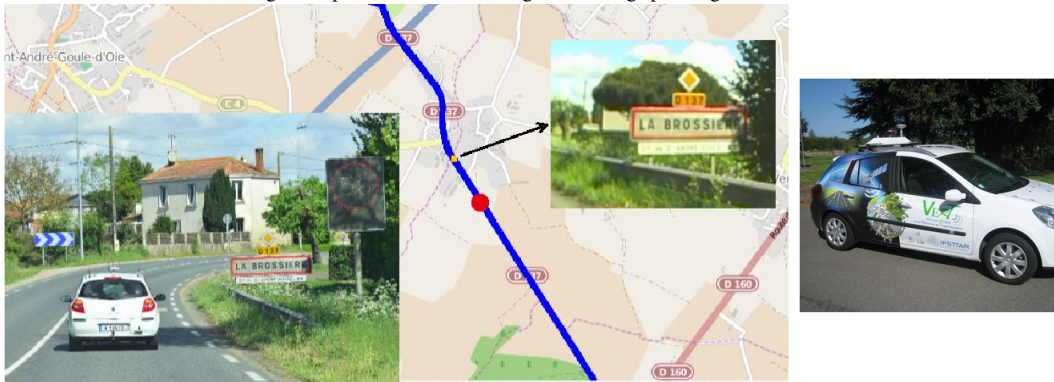
Fig. 1. Experimental car reaching the limiting speed sign at "La Brossiere"

As detailed in Coiret et al. (2016), experiments have been done while crossing the French small village "La Brossiere". The village is represented in gray on the map (Fig. 1), with the yellow dot on the blue route representing the village entrance panel. This panel is located in a long and strong descent forcing drivers to brake to conform to the regulatory speed.