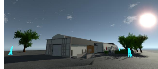
Figure 2: Nursery in VR.

the visibility of the objects. In this study case, we apply a binary choice: when walking outdoor, indoor objects are hidden, to consume less resources and when walking indoor, everything is loaded: in one future work we could show only the rooms close to the current one. About lights, as the building project is on built phase, major modifications are not possible. But at least users want to check the exposure depending on the sun, the interior lights and the walls/windows materials. For this issue we had to get back the building orientation from Revit to Unity. Then we use the Revit solar cycle simulation to get the positions of the sun path, depending on the date of the year. In Unity, we simulate three different solar cycles (equinox, summer and winter solstice). So we allow end users to check the building exposure in the VR system and to ensure quality to the user experience, users can stop at any moment the solar cycle and stay with the current exposure.