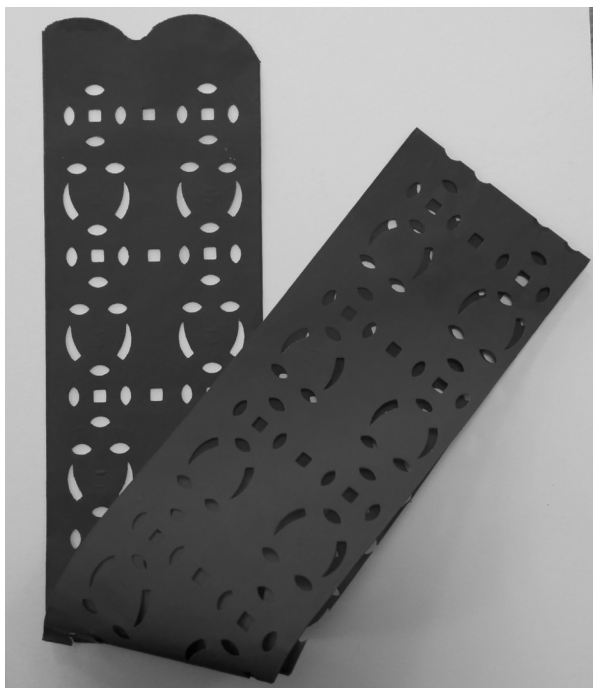
Fig. 4 Funerary money China, 21 st century, l. 44 x L. 74, Ashmolean Museum.