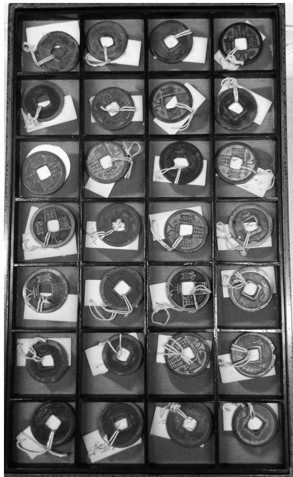
Fig. 2 Coin cabinet (detail), Japan – late Edo period, L. 26 x l.15.5 x H. 16, Ashmolean Museum.