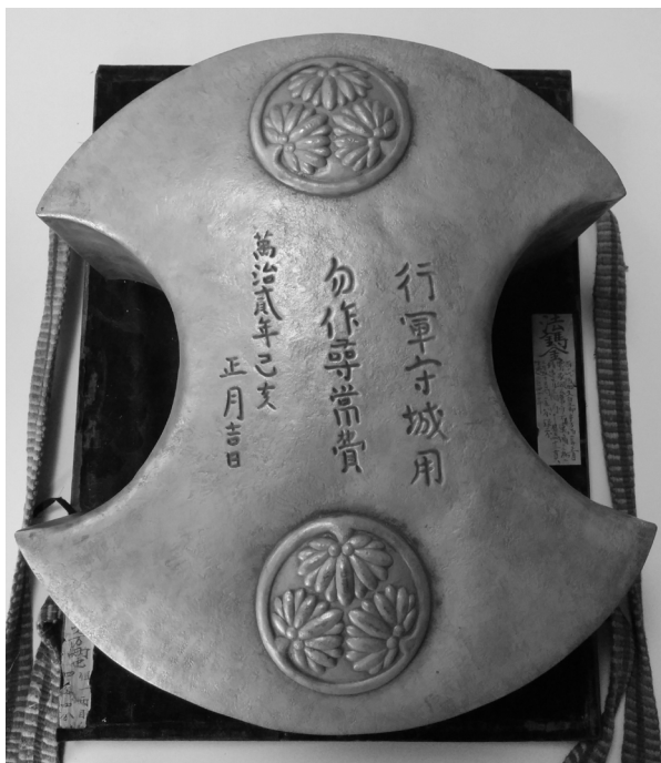
Fig. 3 Gold ingot (imitation) 大法馬金, Japan – end of 19 th century, L. 43 x l. 32, Ashmolean Museum.