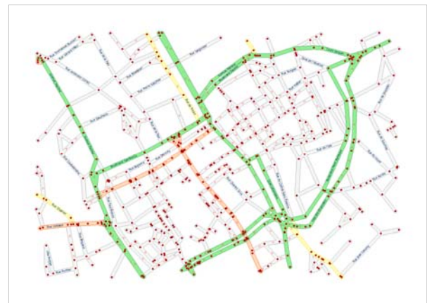
Figure 3: Center city of Troyes, France.