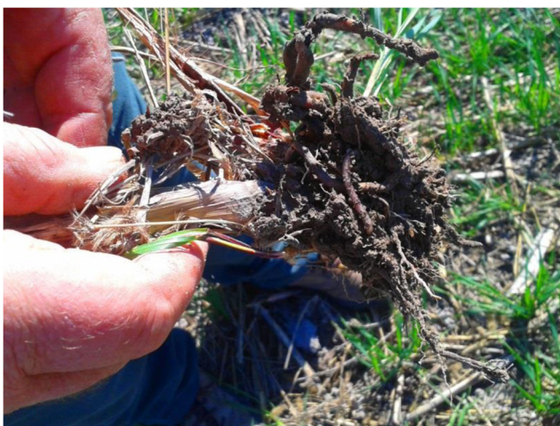
Fig. 1 Farmer experimenting wheat cultivation without tillage (here after sorghum). Observation of earthworm presence

A conceptual model of experimental situations was built based on the literature (section 2.1). The model was used as