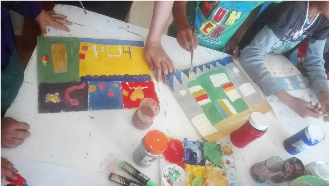
Figure 5 During the workshop "Inside the house of my dream"

We had very few scenes of war in the drawings, first because few of the children have experienced the siege of ISIS and second because there were 3 years between them and the war. Finally, the children are living in a situation of "stability", despite the fact that he is in a temporary camp.