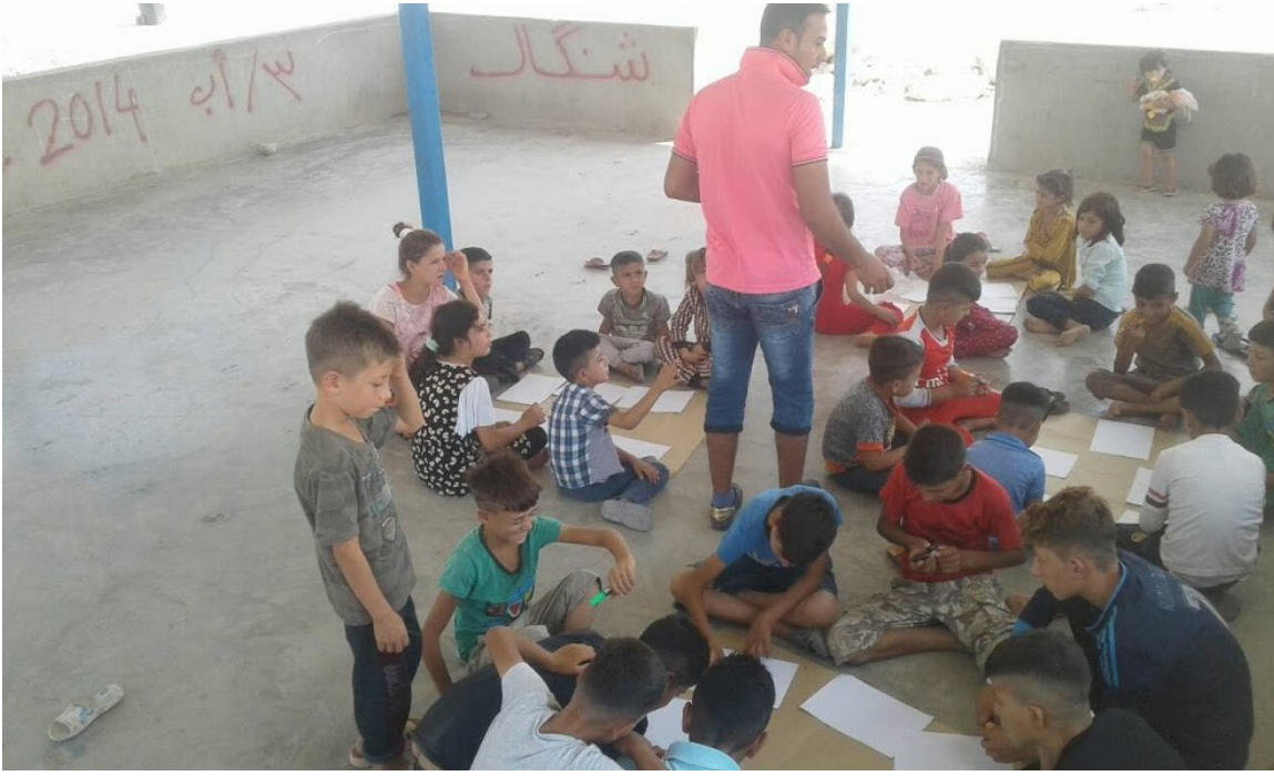
Figure 4. Improvised workshop on dreaming by a facilitator

In addition, unlike the multiple sources of violence in the camp (Buriel, 2017), we did not have a negative behaviour problem to deal with. Artistic work has obviously fostered cooperative and targeted behaviour as well as problem solving. We have seen that this has excited the facilitators, one of whom has taken the initiative to make an improvised artistic workshop for the first time( Figure 4). As the workshops could not be addressed to all the children in the camp, the facilitator decided to hold a workshop on dreams with children far from the usual place in the public space of the camp. Figure 4 shows how the facilitator sees the interactions during this workshop. These are small groups of participants who can interact freely. The facilitator also saw the benefits of the first workshops and felt able to lead it alone and freely. We also noted that when the two camp communities are present in the same workshop, there are far fewer inter-community interactions than there are between Yazidis or Sunni children. Nevertheless, we have been particularly vigilant about possible tensions, but we have not detected any. It seems that artistic workshops with creative topics tends to reduce such frictions, which are nevertheless visible in public spaces.