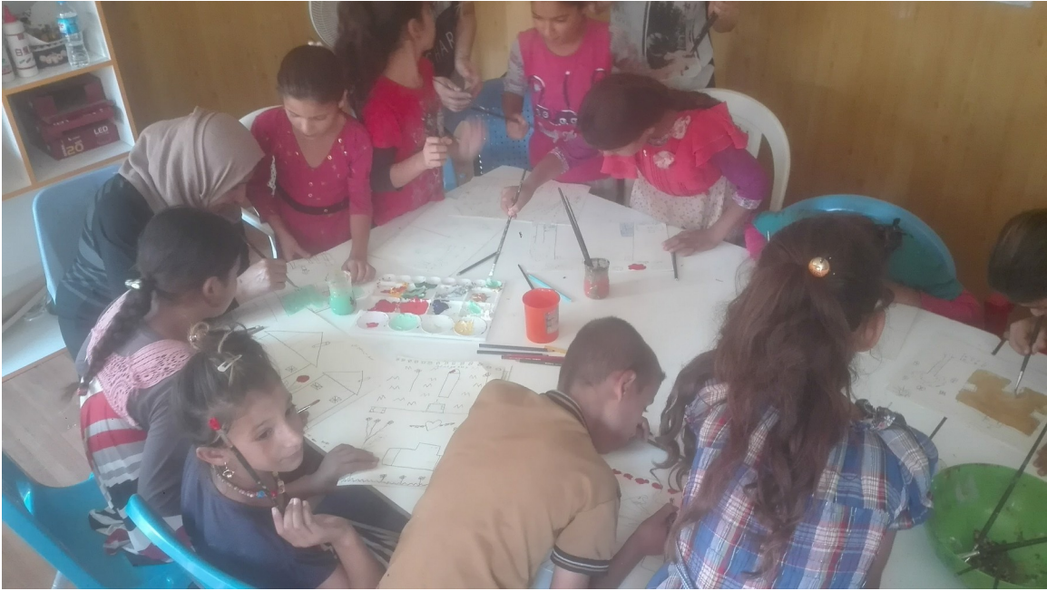
Figure 3. Open interaction between facilitators and participants and collaboration between peers

The facilitators' postures were rather withdrawn in order not to interfere with the young people's experience even if some of them tended to help children by taking the brush instead of them. A facilitator wanted to help them so that they could succeed in their production. The children were coming to them when they needed it (Figure 3), children seek validation from their peers but communicate relatively little about the content of their individual productions. The main interactions involved the drawings, shared material or sometimes external subjects (another absent child, a party, what they will do in the afternoon, an older brother who has left for work). The atmosphere of the workshop is punctuated according to the tasks to be accomplished but it is conducive to exchanges that are serene and positive because the children reveal their current concerns but are especially focused on their ongoing work. The feeling of being free to express oneself in a secure space and to collaborate serenely is a sign of well-being as the show of their production to the others.