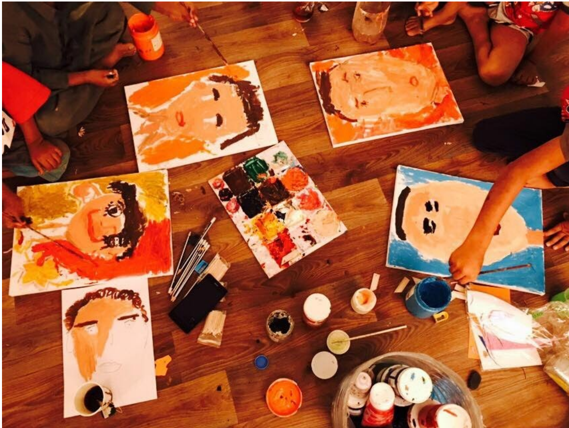
Figure 2. Young children painting for the first time at an identity workshop

and then follow one of the animators in the way they take the brush. The children's postures are generally in the adherence to the activity and integrated into the collective. This active participation is, in our opinion, a positive sign that children are able to connect and assimilate into a group, following a common activity.