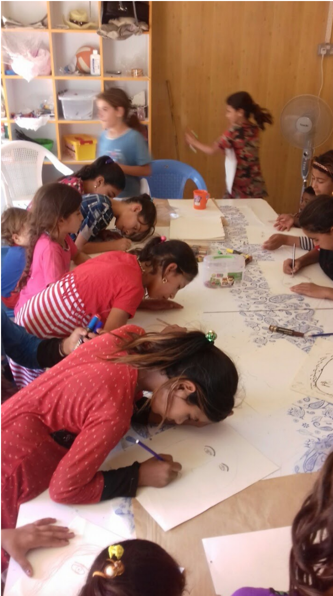
Figure 1 : Young children painting for the first time at a workshop about identity

In addition, some of the children are used to coming and going during the workshops or arriving late. This was not the case during this series of workshops. The children stayed