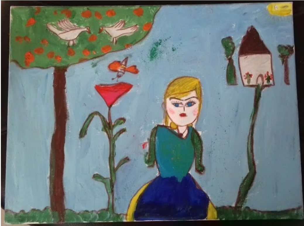
Figure 7: A young girl has created the house of her dreams

that is only expected or hoped for. Productions are sometimes a mixture of a past environment and a present situation in a framework expected for the future. The future seems to have difficulty penetrating the imagination and a kind of regret of a past life seems to be the point of reference for the hopes for a future for these children. Thus, it is considered here that children caught in material constraints and instability, for a majority of them, understand waiting and try to cope with it through forms of resilience. It also seems to us that waiting serves to carry the present in order to sustain it and maintain the acceptable expectation of a better future.