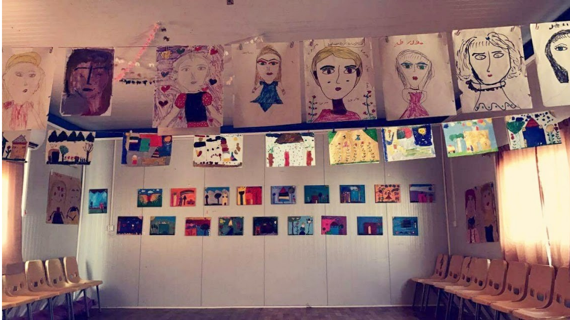
Figure 10. Exhibition of children's works on the theme of dreams for the camp communities

characterize their suffering. Thus, our analysis shows how much participating children have the ability to adapt and act in the face of adversity, as Veronese et al. (2018) also note in their study. We consider these skills to be signs of well-being that can equip these children for future challenges.