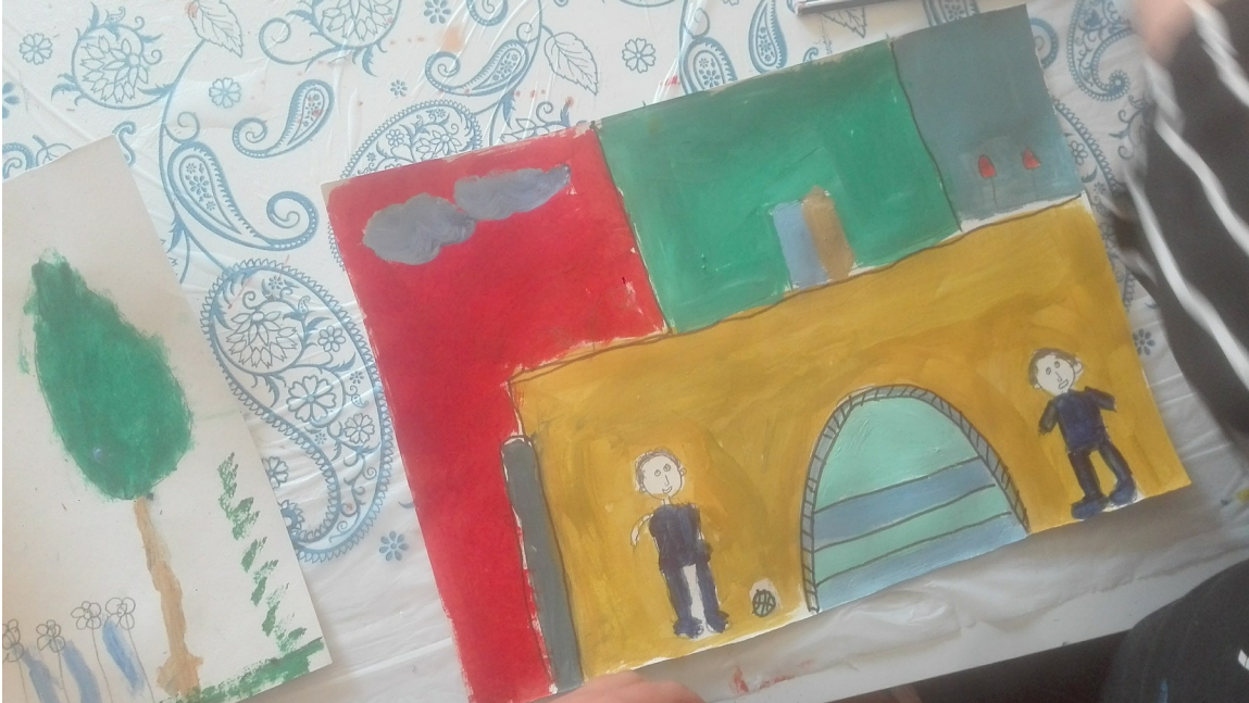
Figure 6. A boy drew himself with his friend playing football in his house

longer only in figuration but was involved as a person in the elaboration of the production. At first, we see children finishing their drawing very quickly. They were guided to enhance their drawing, and this became a standard (Figure 5). There was therefore a consideration for "beauty" or "aesthetics". They gained confidence and make sure to fill their canvas in order to perfect their composition.