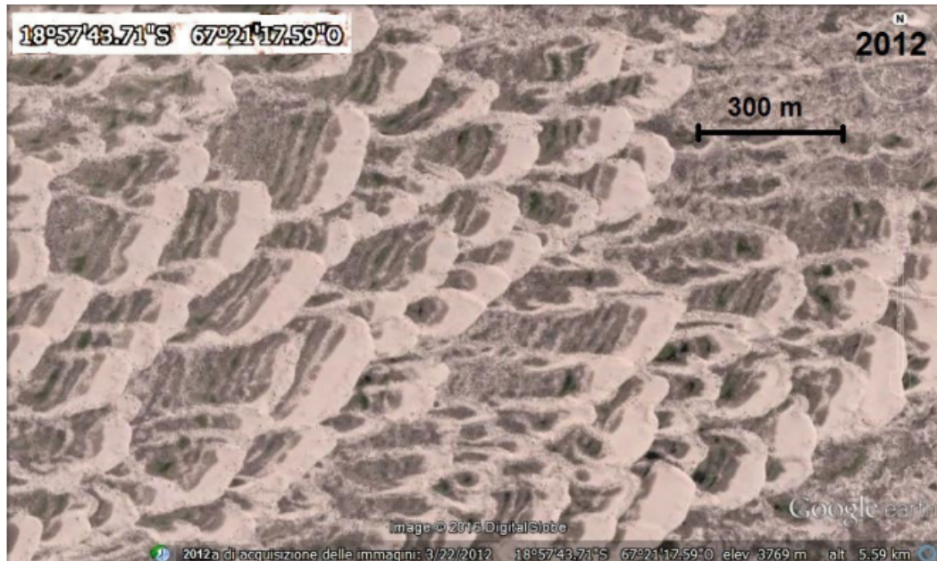
Figure 2: Sedimentary patterns of a dune field in Orinoca Canton, Bolivia. Note the “footprints” of the dunes (see [28]).

Also the sedimentary patterns of the dunes can be easily studied, by means of satellites [28-30] (see for instance the Figure 2). Moreover, the satellite images also show that the dunes can change their shapes, as it is happening for the barchans of the Laayoune-Sakia El Hamra region and Khenifiss National Park [31,32] (see the Figure 3). Is this a consequence of the Climate Change?