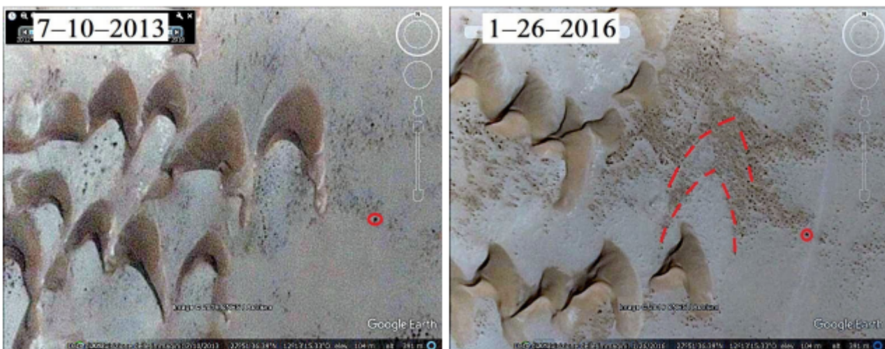
Figure 3: Barchans move and can change their shapes (the red circle is the reference point). Note the faint “ghost” shapes (marked in red) of the previous position and shape of a dune (more details in [31,32]). The change in the shape was driven by a variation of the direction of prevailing winds. Is this variation induced by the Climate Change?