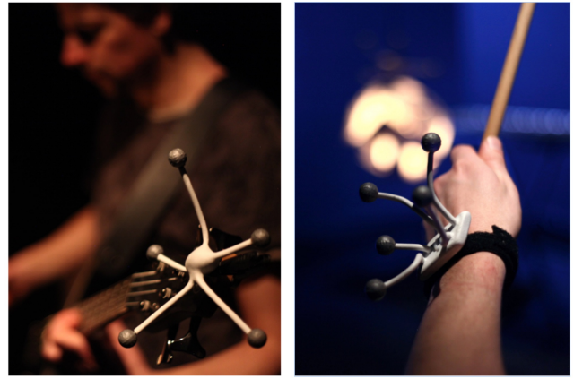
Figure 5: Left: target on bass guitar; Right: target on performer's wrist.

The public presentation for the Journée Science et Musique event was performed in front of an audience of about one hundred and fifty people, and lasted about twenty minutes.