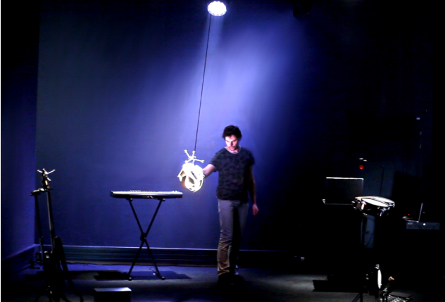
Figure 4: Overview of the Vis Insita performance.

The pendulum was suspended in the centre of the playing area, as presented in Figure 4. It was equipped with an IrT whose movements were captured by the eight cameras of the MoCap system, four hung on the technical grid, and four placed on the ground.