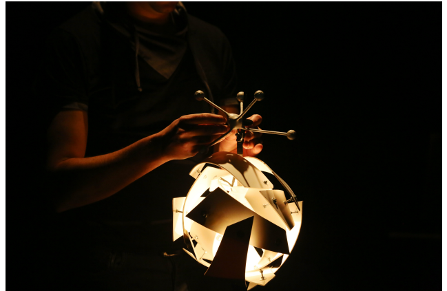
Figure 1: The light pendulum equipped with its passive infrared target.

As the object was intended to be observed by the public, it was important to also think about its aesthetic aspect. Poetically inspired by the inner force of matter ( Vis Insita ) defined by Isaac Newton [14], we started with the aesthetic idea of an "energy ball" (Figure 1).