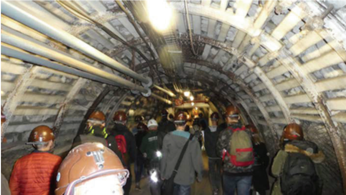
Fig. 4. Participants of the EDUTECH training at “Guido” Coal Mine in Zabrze – a monument/museum at the “Route of Industrial Monuments” of Silesia Region.

The second training mobility was held in Nancy, France and was dedicated for exchange of good practices at the level of primary education. Two schools participated in the activity: Primary School of Pyskowice (Poland) and St. Leon IX School from Nancy, France (as a hosting school). Supporting partner was University of Lorraine. The structure of training was similar to first, above described activity in Poland. The training was focused on digitalization of the world. Students attended dedicated workshops at the university and organized students games at school. Supporting activities contained e.g. visit at Nancy aquarium and nature museum and history games in the city. It is important to note that Nancy has a history with interesting links to Poland – one of the most powerful governors of Nancy in eighteenth century was Stanislaw Leszczyński, former king of Poland. So, Polish participants of the exchange explored history of “King Stanislas” (which is his common name in Lorraine) in Nancy.