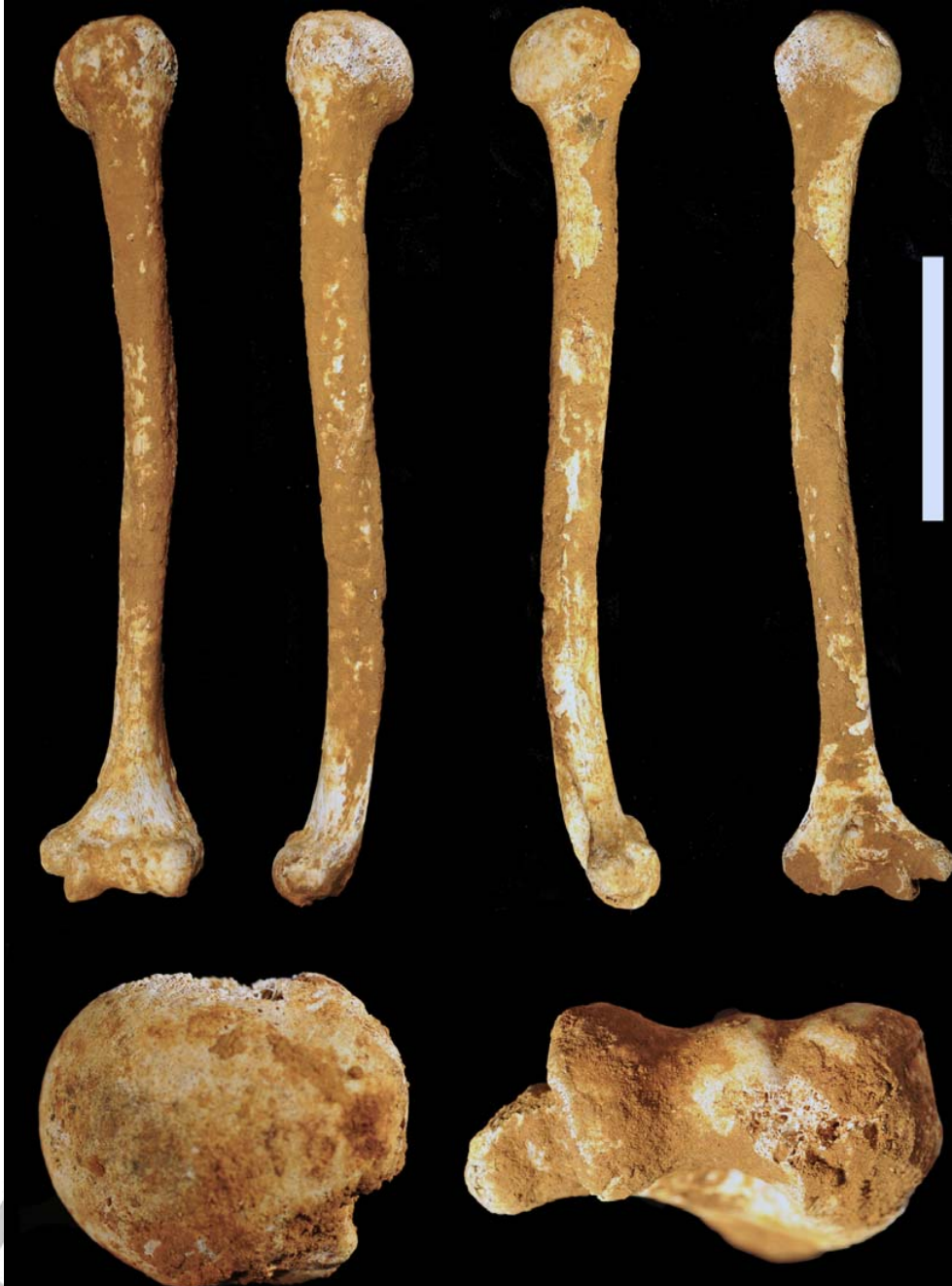
Fig. 2 Views of Cussac L3-088. Clockwise from top left: anterior, lateral, medial, posterior (scale = 10 cm), inferior and superior (not to scale) / Vues du spécimen Cussac L3-088. Dans le sens des aiguilles d'une montre en partant du côté supérieur gauche : antérieure, latérale, médiale, postérieure (échelle = 10 cm), inférieure et supérieure (pas à l'échelle)

a Indicates a measurement obtained from the 3D model / Indique une mesure obtenue à partir du modèle 3D Merci de vérifier les notes de tableau