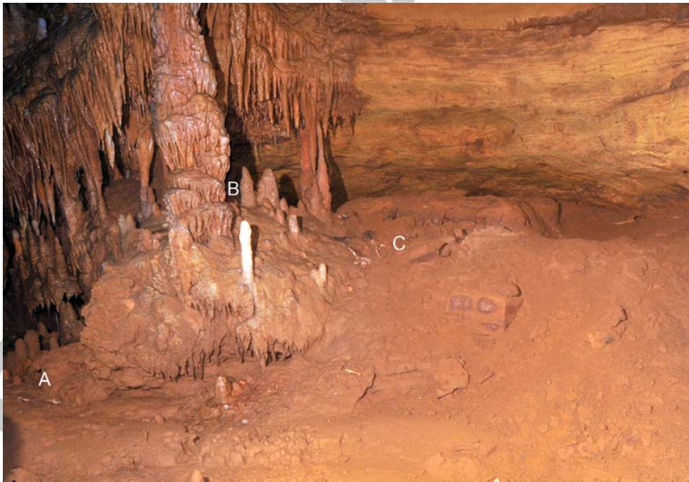
Fig. 1 General view of Locus 3. A. The isolated humerus L3-088. B. Platform. C. Slope with the main concentration of bones / Vue générale du Locus 3. A. L'humérus isolé L3-088. B. La plateforme. C. Principale concentration d'ossements sur la pente

Cross sections at 50% and 35% of the diaphysis were analysed in order to obtain total cross-sectional area, cortical area and variables correlating with the bending moments (second moments of area: I) and overall torsional rigidity