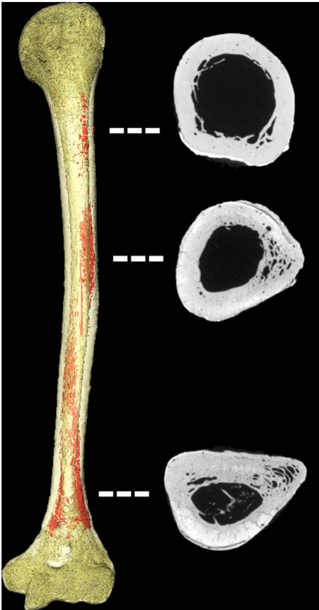
Fig. 3 Distribution of humeral intracortical porosity. 3D model of the humerus with regions of intracortical porosity indicated in red (left) and three transverse slices from different positions in the diaphysis, as indicated by the dashed white lines (right) / Distribution de la porosité intracorticale. Modèle 3D de l'humérus avec les régions de porosité indiquée en rouge (à gauche) et trois coupes transverse dans la diaphyse (à droite), aux localisations indiquées par les lignes blanches pointillées

A less convincing cause may be a posteromedial olecranon impingement, which is a common injury encountered in the throwing elbow, and is commonly associated with osteoarthritic changes including the possible presence of loose bodies and chronic stress fracture at the olecranon process [43,44]. However, there is no sign of any abnormal contact