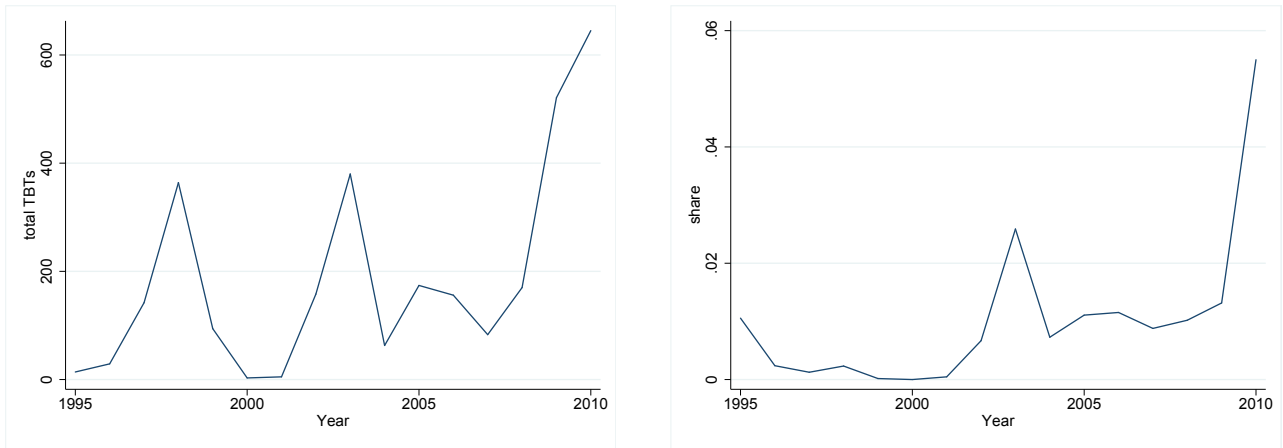
(a) Total Number of TBTs

Note: number of sector-destination pairs under ongoing EU-raised STCs on TBT.