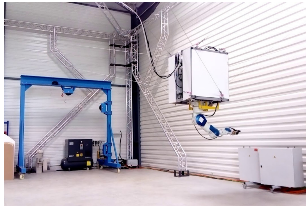
Fig. 1. Cable-driven parallel robot CoGiRo with a 7-DOF robotic arm.

Several previous works on CDPRs dealt with the issues of cable-cable, cable-platform and cable-object collisions. The determination of the loci of cable collisions within a prescribed workspace is presented in [3], [4] in the case of a constant-orientation workspace and in [5], [6], [7] in the case