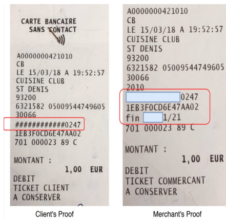
Fig. 1. PoS Proofs for Contact/NFC Purchase Transactions

As presented in the 3rd Attack in section III-A, the client's receipt contains the PAN and ExpDate truncated, whereas the merchant's receipt contains the PAN and the ExpDate in clear. In Figure 1, we illustrate an experiment that we have done in agreement with a merchant who agreed to give us the receipts printed by his PoS . The banking data are marked by a red rectangle. In the client's receipt, we can notice that the banking data are truncated whilst in the merchant's receipt they are in clear (the blue band is to hide our data).