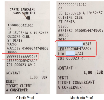
Fig. 1. PoS Proofs for Contact/NFC Purchase Transactions

As presented in the 3rd Attack in section III-A, the client's receipt contains the PAN and ExpDate truncated, whereas the merchant's receipt contains the PAN and the ExpDate in clear. In Figure 1, we illustrate an experiment that we have done in agreement with a merchant who agreed to give us the receipts printed by his PoS . The banking data are marked by a red rectangle. In the client's receipt, we can notice that the banking data are truncated whilst in the merchant's receipt they are in clear (the blue band is to hide our data).