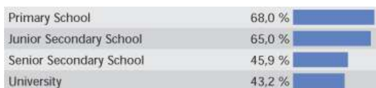
Table 3 : National minorities' share in Xinjiang's total school population in 2000

Source: 2002 Xinjiang tongji nianjian, op. cit., pp. 612-613.