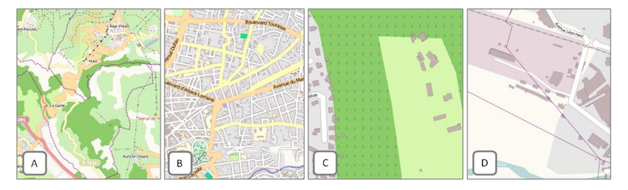
Figure 1 Four examples of maps with level of detail problems. (a) The mountain road (orange) is too detailed compared with land use and coalesces at this scale. (b) Buildings are too small to be displayed at this scale. (c) The forest is much less detailed than buildings causing overlaps. (d) Industrial (purple) and commercial (grey) parcels overlap buildings as their level of detail is not compatible with maps with buildings at this scale.

This level of detail heterogeneity has a major drawback: whatever the scale, it is very difficult to make legible maps with OSM data. When scale is small, very detailed features like roads or buildings need cartographic generalization to be legible (Figure 1A & B). Indeed, (Gaffuri, 2011) claims generalization is a problem for most web maps. On the other hand, when scale is large, small scale features may be inconsistent with very detailed features (Figure 1C & D).