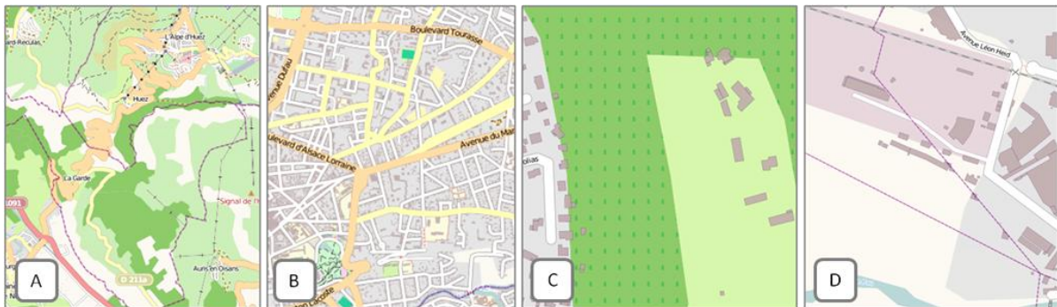
Figure 1 Four examples of maps with level of detail problems. (a) The mountain road (orange) is too detailed compared with land use and coalesces at this scale. (b) Buildings are too small to be displayed at this scale. (c) The forest is much less detailed than buildings causing overlaps. (d) Industrial (purple) and commercial (grey) parcels overlap buildings as their level of detail is not compatible with maps with buildings at this scale.

This level of detail heterogeneity has a major drawback: whatever the scale, it is very difficult to make legible maps with OSM data. When scale is small, very detailed features like roads or buildings need cartographic generalization to be legible (Figure 1A & B). Indeed, (Gaffuri, 2011) claims generalization is a problem for most web maps. On the other hand, when scale is large, small scale features may be inconsistent with very detailed features (Figure 1C & D).