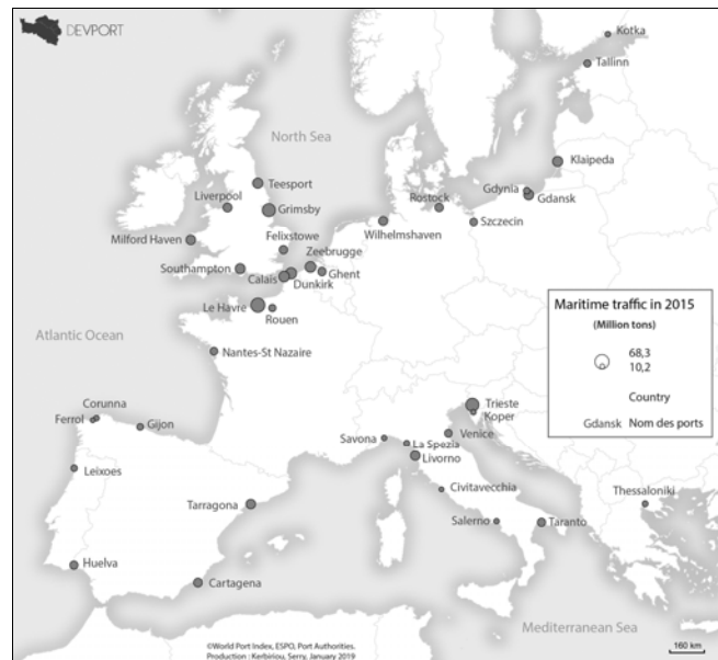
Figure 1. Medium-sized port cities in Europe

Defining the thresholds can be subject to discussion. It is perhaps surprising to see Le Havre (because of its port traffic) classed amongst medium-sized European port cities. But, yet as early as 2004, Le Havre was not classified as a major European port despite being one of the highest performing as regards container traffic (Rozenblat, 2004). If we look again at the defining components above, its inclusion in the benchmarks seems legitimate.