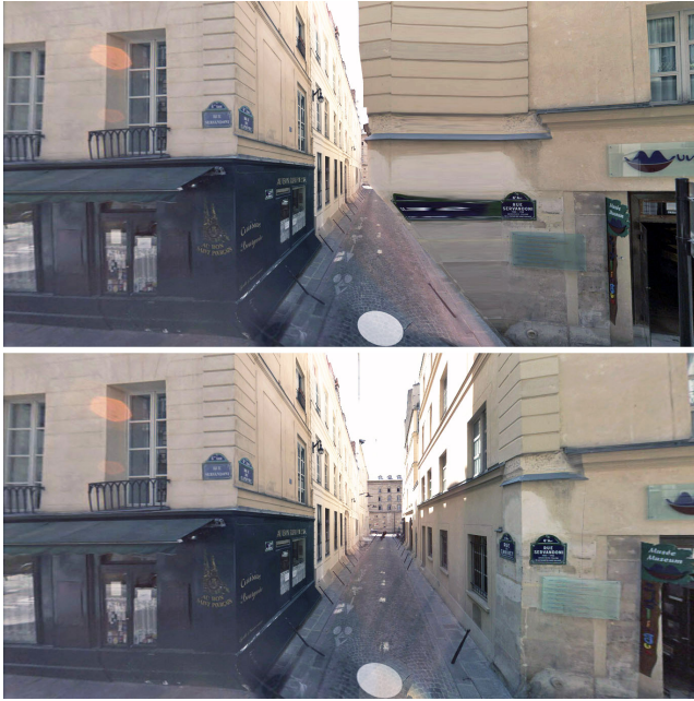
Figure 6: View-dependent texturing with (bottom) and without (top) occlusion handling.

(windows, doors, insets...). To cope with this issue, the mesh is rendered with an offset (e.g. 1m) that lets points belonging to small depressions pass the depth test.