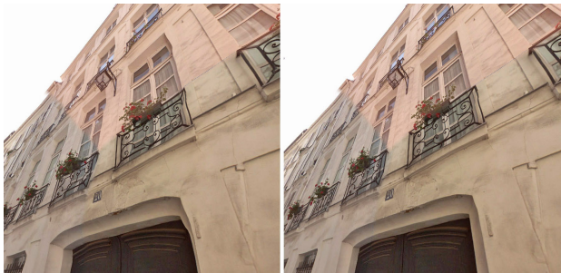
Figure 3: Comparison of support for projective texturing. Poisson reconstructed mesh from Lidar (left) and simple planar geometry (right)

by deformed textured meshes even though geometrically closer to reality than by very approximate planar geometries inducing more parallax effects (fig. 3). Creating a simplified mesh from the point-cloud using the previously discussed methods requires very refined algorithms working on high quality point clouds to get acceptable results inducing also heavier data to be transmitted and rendered. Another artefact often encountered while creating meshes is the loss of small details. In our case, we found it very hard to create meshes that could keep geometry such as vegetation, poles, balconies, and more generally, urban furnitures. This is problematic as the user moves through the streets, as it means that the texture will be projected on an incorrect geometry, typically flattened on the ground or façades, inducing an unpleasant rendering (fig. 1.a).