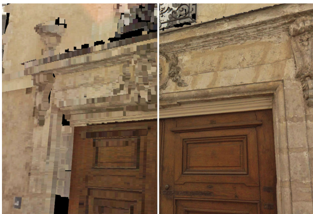
Figure 4: Comparison of point cloud rendering. (left) Basic point sprites, 1 color per point. (right) Projective textured point sprites

Figure 4 shows the large difference of rendering quality when computing one color per point versus texturing the whole point surface.