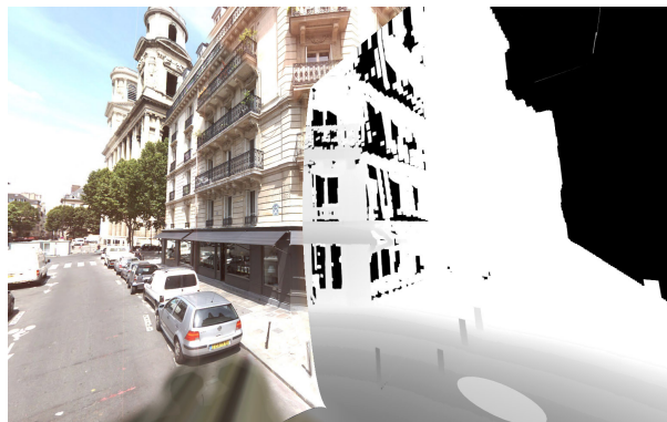
Figure 5: Depth map for one projective texture (right) mixed with original imagery from other projective textures (left).

We adapted the shadow mapping-like technique from mesh-only [Brédif 2013] to hybrid rendering (mesh+pointcloud). This is performed by computing an off-line rendering of the scene from each texture position, creating a depth texture that is pixel-wise aligned with the (undistorted) input color image (fig. 5). While rendering, a simple depth (shadow) test is performed between a texturing depthmap lookup and the depth relative to the sampled texture viewpoint. This technique is relatively cheap as it only costs a one-time depth-pass during the initialization phase and a comparison against a texture sample (i.e. a shadow test) in the rendering phase.