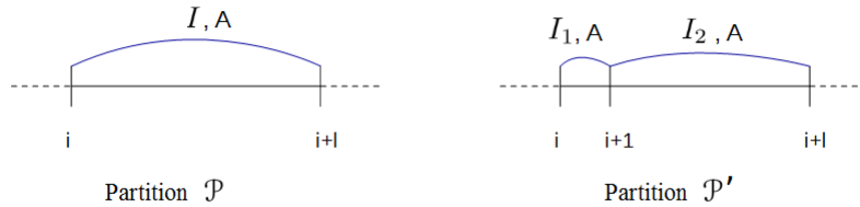
Figure 3: Step 1: segments of type A

Consider any segment I = [\frac{i}{k}, \frac{i+l}{k}] of type A with l, i integers verifying i + l \leq k and l \geq 2 , such that Firm 1 is in constrained monopoly on this segment. We show that dividing this segment into two sub-segments increases the profits of Firm 1. Figure 3 shows on the left panel a partition with segment I of type A, and on the right, a finer partition including segments I_1 and I_2 , also of type A. We compare profits in both situations and show that the finer segmentation is more profitable for Firm 1. We write \pi_1^A(\mathcal{P}) and \pi_1^{AA}(\mathcal{P}') the profits of Firm 1 on I with partitions \mathcal{P} and on I_1 and I_2 with partition \mathcal{P}' .