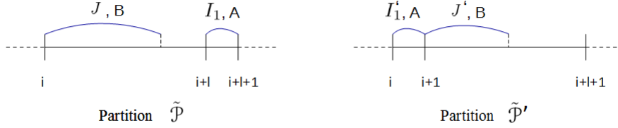
Figure 4: Step 2: relative position of type A and type B segments

Going from left to right on the Hotelling line, look for the first time where a type B interval, J = [\frac{i}{k}, \frac{i+l}{k}] of length \frac{l}{k} , is followed by an interval I_1 = [\frac{i+l}{k}, \frac{i+l+1}{k}] of type A, shown to be of size \frac{1}{k} in step 1. Consider a reordering of the overall interval J \cup I_1 = [\frac{i}{k}, \frac{i+l+1}{k}] in two intervals I'_1 = [\frac{i}{k}, \frac{i+1}{k}] and J' = [\frac{i+1}{k}, \frac{i+l+1}{k}] . We show in this step that such a transformation increases the profits of Firm 1.