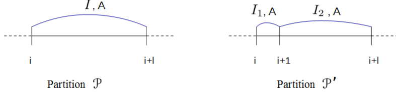
Figure 3: Step 1: segments of type A

that dividing this segment into two sub-segments increases the profits of Firm 1. Figure 3 shows on the left panel a partition with segment I of type A, and on the right, a finer partition including segments I_1 and I_2 , also of type A. We compare profits in both situations and show that the finer segmentation is more profitable for Firm 1. We write \pi_1^A(\mathcal{P}) and \pi_1^{AA}(\mathcal{P}') the profits of Firm 1 on I with partitions \mathcal{P} and on I_1 and I_2 with partition \mathcal{P}' .