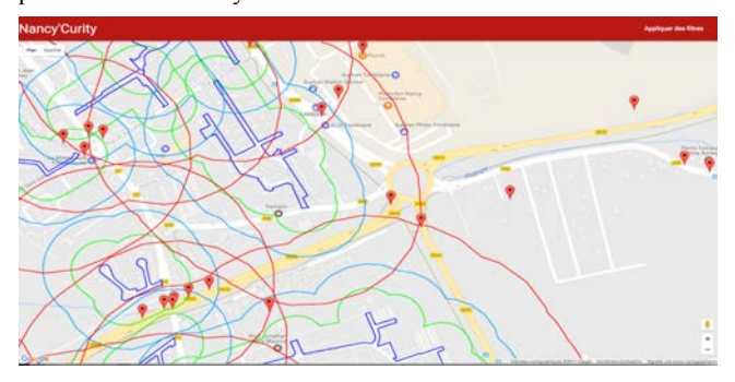
Figure 4. One of the two screenshots provided to the participants.

finally, the only difference between the two case studies is their place in the same city.