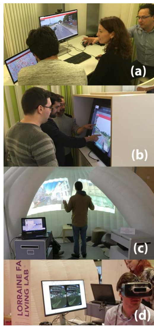
Figure 1. Pictures of LF2L showing the "low-cost" immersive technologies