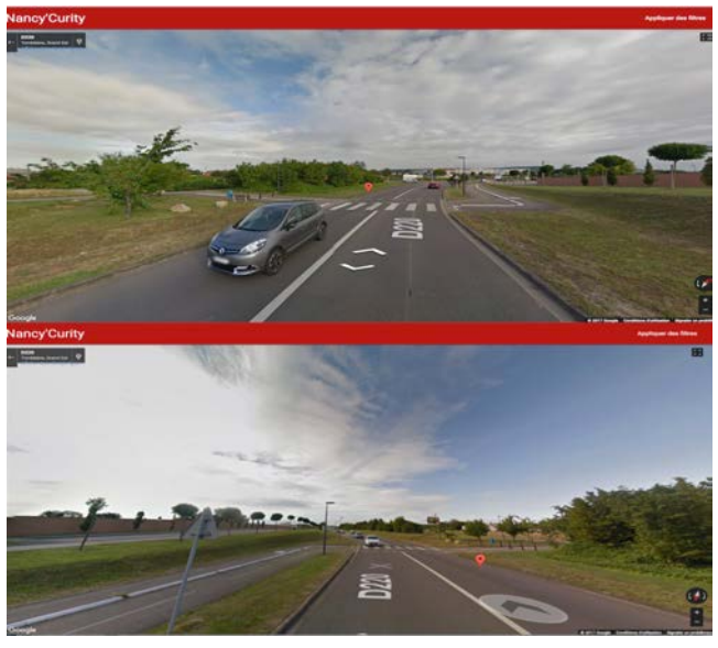
Figure 6. Two views of one case study located by pinpoint