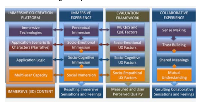
Figure 2. ICE Model [34] based on four different but complementary immersive perspectives, extended from the IVE Model [22]

There are different forms of social interaction but vocal interaction is the one that requires the highest level of participants' attention. While vocal interactions support the feeling of social presence, it makes easier the ability to reach a shared mutual understanding for each participant [41], [50]. According to Eynard, a participant of an experiment declared during the focus group debriefing [41]: "I was staying as close as possible to my team partner in the virtual environment as if I was willing to remain audible while I perfectly new that we were in fact talking to each other through the use of a headset". This empirical study demonstrated that vocal interaction tends to decrease the feeling of being present, while at the same time it increases the feeling of co-presence.