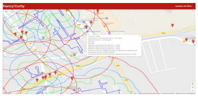
Figure 5. Pinpoints give details on road accidents (conditions, causes, impacts, etc.)

The team exercise is composed of three tasks to be carried out in a global time of 15 min. The participants must find the road accident case's place on the dynamic map generated by "Nancy'curity" app. Then teams had to analyse and describe the events leading up to accidents (urban environments, involved persons, weather conditions, etc.) and the potential causes. With this shared diagnosis, each team had to imagine and design how to improve both the urban environment and road safety. During the exercise each team can navigate in the web app (Figures 4, 5 & 6) and fill in a shared paper form with their suggestions.