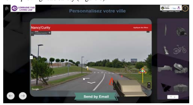
Figure 8. One co-creation generated with Multitouch Table platform and its experimental interface.