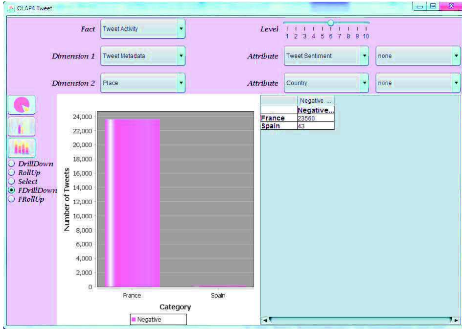
FIG 8. Interface after the execution of the FDrilldown operator