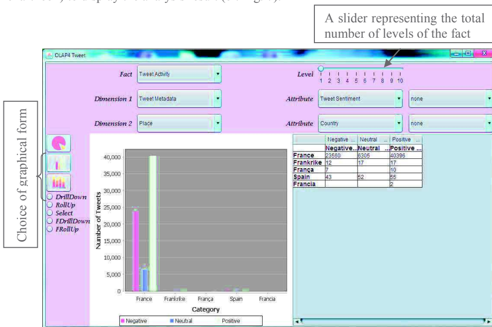
FIG 7. Number of tweets by Tweet-Sentiment and by Country.

To illustrate how the FDrilldown and FRollup operators perform, we provide an example of analysis. We assume that the decision-maker wants to analyze the number of tweets by Tweet-Sentiment (of the TWEET-METADATA dimension) and by the parameter Country (of the PLACE dimension). A bar chart is required by the decision-maker ((s)he just click on Bar chart icon) to display the analysis result (cf. Fig. 7).