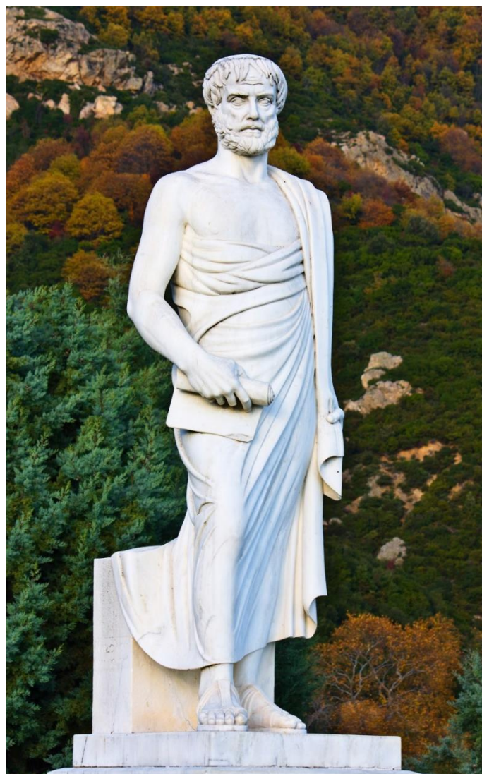
Fig. 1. Statue of Aristotle in Stagira, Greece.

Throughout our careers we are taught to conform to the status quo , i.e. to the opinions and behaviors of others. Organizations and their workers both pay a price: decreased engagement,