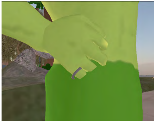
Figure 1: The Magic Ring on an avatar’s finger in Second Life .

To meet planned need, I developed a tracker intended to be worn by avatars themselves. This tracker is a ring in the virtual world (Figure 1) and I called it the ‘Magic Ring.’