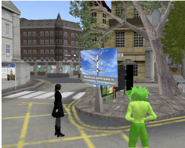
Figure 2: Two avatars in front of a Magic Ring distributor.

Avatars can obtain the Magic Ring from automatic distributors (Figure 2) spread over many Second Life areas. When an avatar clicks on a distributor, he gets a Magic Ring and an information sheet about the options and features of the tracker as well as all of the study conditions. This document also includes a code of ethics and responsibilities, which is inspired by the code of ethics of the French Sociological Association (AFS), and the user's rights conferred by the French National Commission of Informatics and Liberties (CNIL).