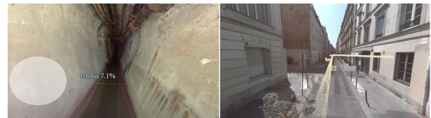
Figure 1. Ex situ Virtual Reality (VR) using a WebGL application: a) 3D view of the textured sewer model with interactive measurements. b) 3D view from the street level of the textured 3D city model and the wireframe sewer model.

Virtual Reality (VR). On a desktop PC or Virtual Reality (VR) device, the sewer model could be visualized in 3D with texture (Fig. 1-a) or with wireframe rendering superimposed on street-view imagery and building models (Fig. 1-b).