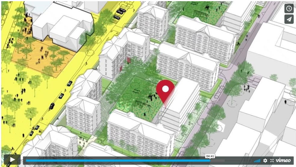
Fig. 4. Visualization and final Esquis'Sons! sound sketch for the Abbaye District, Grenoble – (Architectural Axonometry with the kind permission of Particules Office) France, video [19]

specific sound atmospheres that might be created in the center. It is also the place for plenty of potential sonic interactions between the facades' users and the public spaces. It was also decided to reinforce several uses in the public spaces (as playgrounds for children, a public gardening space, increasing the size and the number of markets during the week, open the ground floor of the buildings to rent for local shops and for craftsmen or young companies). Finally, it also gave goals for the "acoustic" qualities of the facade of the new building. All these scenarios have been input in the application and the result can be listened by following the link below.