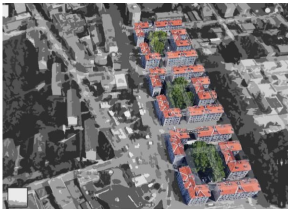
Fig. 3. 3D Satellite view (Google map/IGN) of Abbaye District, Grenoble, France, 2019.

To illustrate this part, recently, Esquis’Sons has also been used in a feasibility and programmatic study of the neighborhood L’Abbaye in Grenoble (France). The Parisian architectural office Particules [17] used an Esquis’Sons! sound sketch to support their scenario for the rehabilitation of the existing buildings. The district of L’Abbaye is a working-class residential area built after the Second World War and currently suffering from a lack of renovation. The majority of apartments, managed by a social housing landlord, are empty because they do not comply with the rules of contemporary construction. The social housing landlord, along with the City Hall had obtained to classify these buildings as elements of the industrial heritage of the 20 th century.