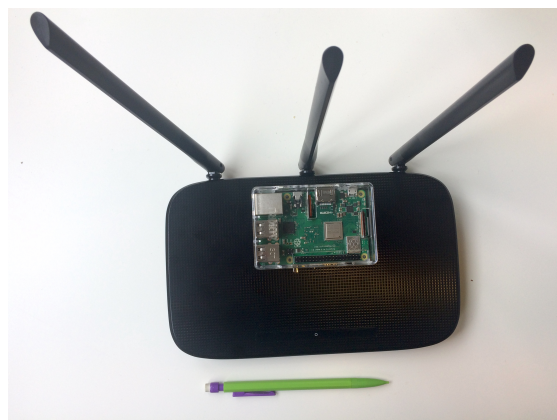
Figure 4. Score display from the performer’s of view.

This low-cost system (less than 65 €, for a Raspberry Pi and a router) now allows the sending of ready-to-use scores. Once the system is power-supplied, all the performers need to do is to join the dedicated Wi-Fi, and type the static IP address of the server on their smartphone/tablet (i.e. for the performers: 192.168.0.100:8000, and for the conductor: 192.168.0.100:8000/conductor). In January 2019, the system was rented to the Caen French conservatoire via BabelScores 25 , thus proposing a rental of performing scores (separate parts) of a new kind.