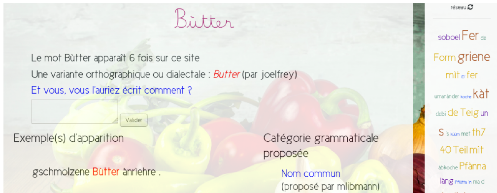
Figure 2: Spelling addition using the wordcloud. The word is shown in its context, with the proposed part-of-speech (if available).