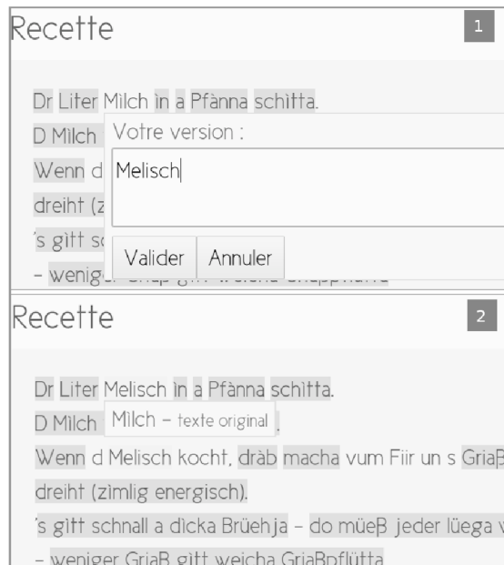
Figure 3: Spelling addition (1) and visualization (2) (highlighted words present at least one additional variant).

interpreted as elements of context. The rules are extracted from each pair of the combination of the aligned variants. From the aligned variants (1) and (2) showcased in Figure 1, four L+R rules are extracted: LR \leftrightarrow LER ; RIE \leftrightarrow RIE ; EWL \leftrightarrow EBL ; HE\$ \leftrightarrow HA\$ . The eight left-and-right-context-only corresponding rules are deduced from the L+R rules.