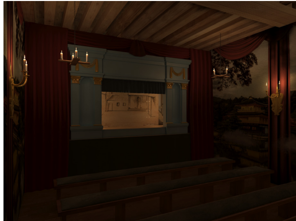
Fig. 3. Miniature of Louis-Nicolas von Blarenberghe, and corresponding digital mockup.

Taking the form of a kind of time machine, such a tool would allow historians and experts to evolve in a virtual situation at the heart of their subject of study. Having simultaneously become a guide of disappeared buildings and a witness to a simulated story (based on scientific sources), the expert would not only provide feedback on the relevance of what he sees, but also information on the postures, trajectories and ways associated with the spaces visited. Such information acquired by the experts could only be reproduced by in vivo practice.