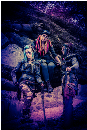
Figure 4: Live action role-players from Elfia Haarzuilen 2014. Their gear is coordinated to fit together into a shared narrative.

engage in collaborative storytelling and problem-solving experiences where creative choice is constrained by rules.