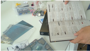
Figure 3: Examples of physical artifacts used in tabletop role-playing games: maps, rule books, tokens, cards, bottle caps, and imagery.