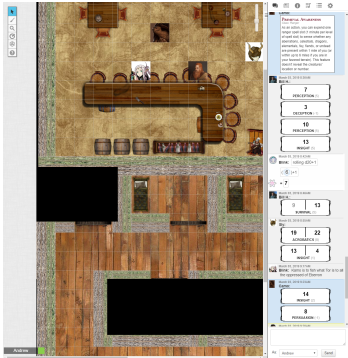
Figure 1: The Roll20 interface: tool palette in top-left; virtual tabletop in middle; and chat on right with dice roll results and non-verbal player conversations.