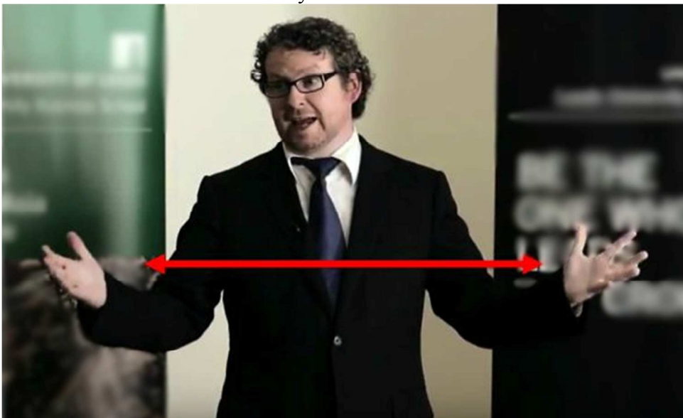
(a) Metaphoric gesture representing the ability of the entrepreneur to cover the entire market. In this gesture, widening of the distance between the hands connotes expanded market coverage.