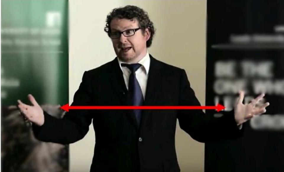
(a) Metaphoric gesture representing the ability of the entrepreneur to cover the entire market. In this gesture, widening of the distance between the hands connotes expanded market coverage.