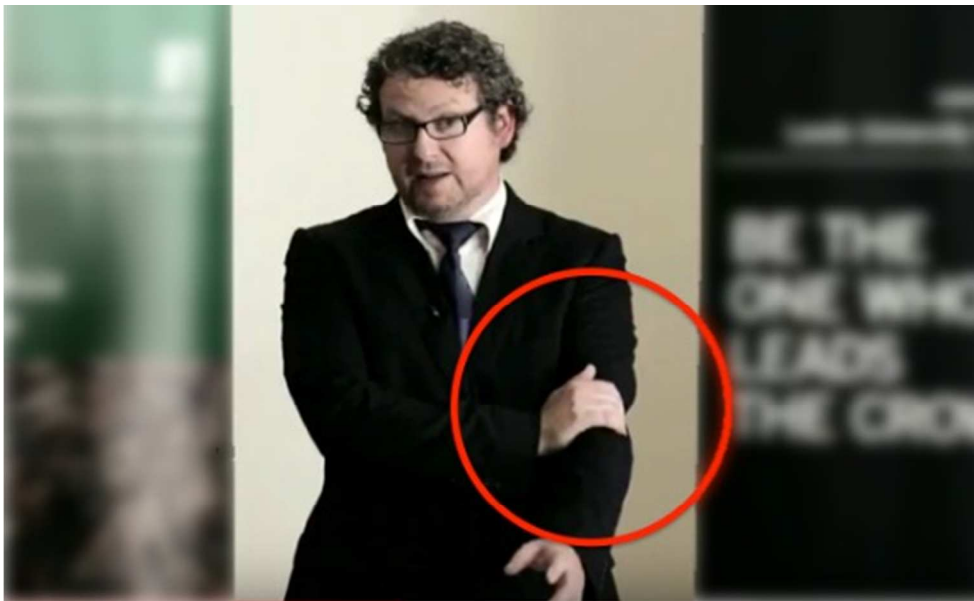
(b) Iconic gesture illustrating product usage. This gesture refers to a physical object (the treatment device) and its placement on the body (compressing an injured joint).