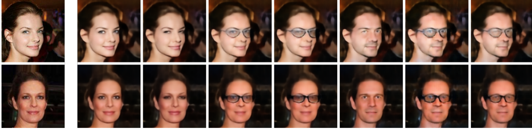
Figure 4: (Zoom in for better resolution.) Examples of multi-attribute swap (Gender / Opened eyes / Eye glasses) performed by the same model. Left images are the originals.

Quantitative results In the naturalness experiments, only around 90% of real images were classified as “real” by the Workers, indicating the high level of requirement to generate natural images. Our model obtained high naturalness accuracies when reconstructing images without swapping attributes: 88.4%, 75.2% and 78.8%, compared to ICGAN reconstructions whose accuracy does not exceed 23%, whether it be for reconstructed or swapped images. For the swap, FADNET SWAP still consistently outperforms ICGAN SWAP by a large margin. However, the naturalness accuracy varies a lot based on the swapped attribute: from 79.0% for the opening of the mouth, down to 31.4% for the smile.