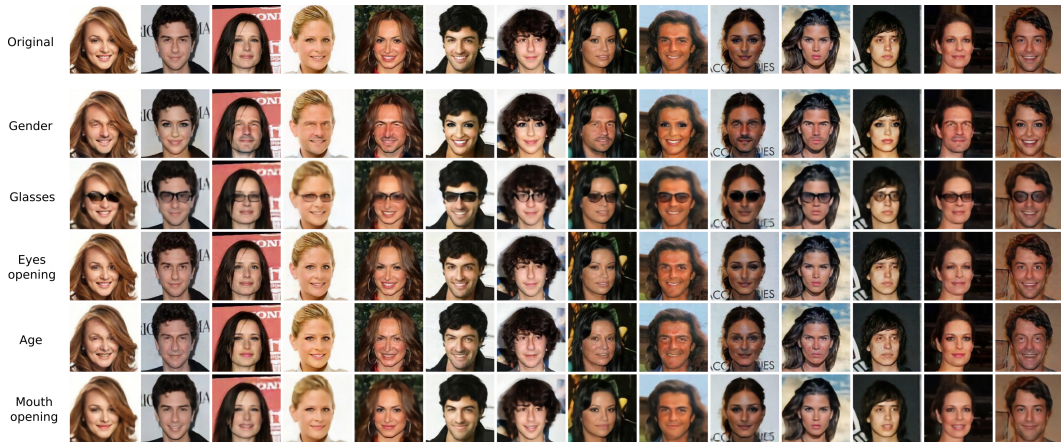
Figure 3: Swapping the attributes of different faces. Zoom in for better resolution.

Qualitative evaluation Figure 3 shows examples of images generated when swapping different attributes: the generated images have a high visual quality and clearly handle the attribute value changes, for example by adding realistic glasses to the different faces. These generated images confirm that the latent representation learned by Fader Networks is both invariant to the attribute values, but also captures the information needed to generate any version of a face, for any attribute value. Indeed, when looking at the shape of the generated glasses, different glasses shapes and colors have been integrated into the original face depending on the face: our model is not only adding “generic” glasses to all faces, but generates plausible glasses depending on the input.