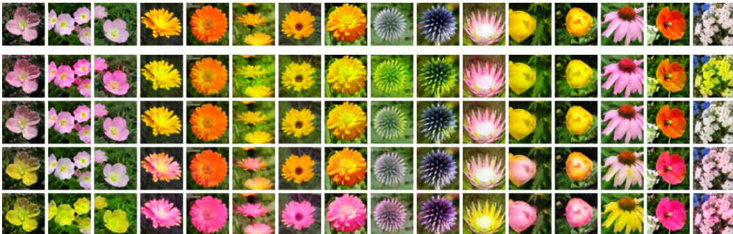
Figure 5: Examples of reconstructed flowers with different values of the pink attribute. First row images are the originals. Increasing the value of that attribute will turn flower colors into pink, while decreasing it in images with originally pink flowers will make them turn yellow or orange.

We performed additional experiments on the Oxford-102 dataset, which contains about 9,000 images of flowers classified into 102 categories [16]. Since the dataset does not contain other labels than the flower categories, we built a list of color attributes from the flower captions provided by [18]. Each flower is provided with 10 different captions. For a given color, we gave a flower the associated color attribute, if that color appears in at least 5 out of the 10 different captions. Although being naive, this approach was enough to create accurate labels. We resized images to 64 \times 64 . Figure 5 represents reconstructed flowers with different values of the “pink” attribute. We can observe that the color of the flower changes in the desired direction, while keeping the background cleanly unchanged.