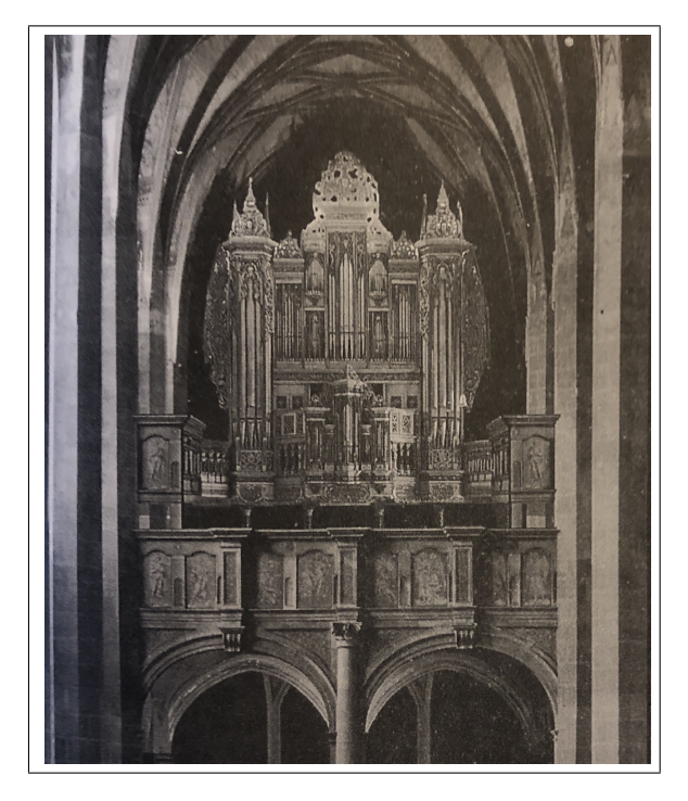
Figure 3 . Wolff's reconstruction of the town piper galleries around the west choir gallery [24]. The strings (and Bach) would have been in the south gallery (on the left), the woodwinds would have played from the north gallery opposite, with the choir one level down on the larger west gallery.