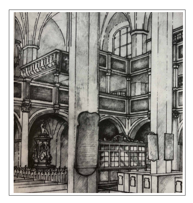
Figure 2 . Reconstruction of the second level of galleries that existed in Bach's time [23].