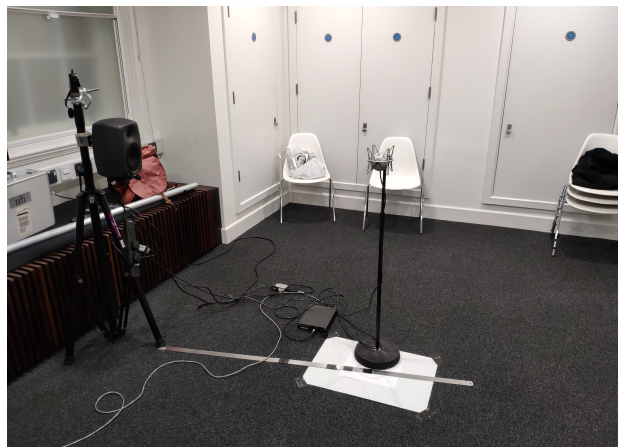
Figure 1: Picture of the room used in this study, before measuring RIRs with the Eigenmike.

with a KEMAR head and torso simulator from six directions (front, back, left, right, up, down). All measurements were made using the sine sweep technique [16] and a Genelec 8030 loudspeaker at a distance of 1.2 m.