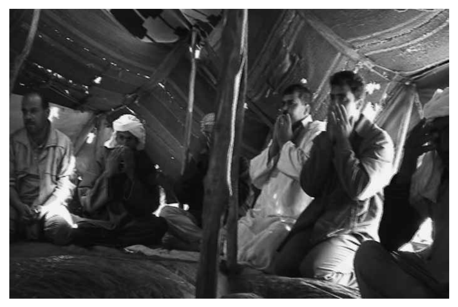
Figure 5.6 The ma'ruf ends. (Film frame: Y. Ben Hounet)

even if they are bored with it. This suggests the normative dimension of the ritual and the kind of opposition/contestation to this norm.