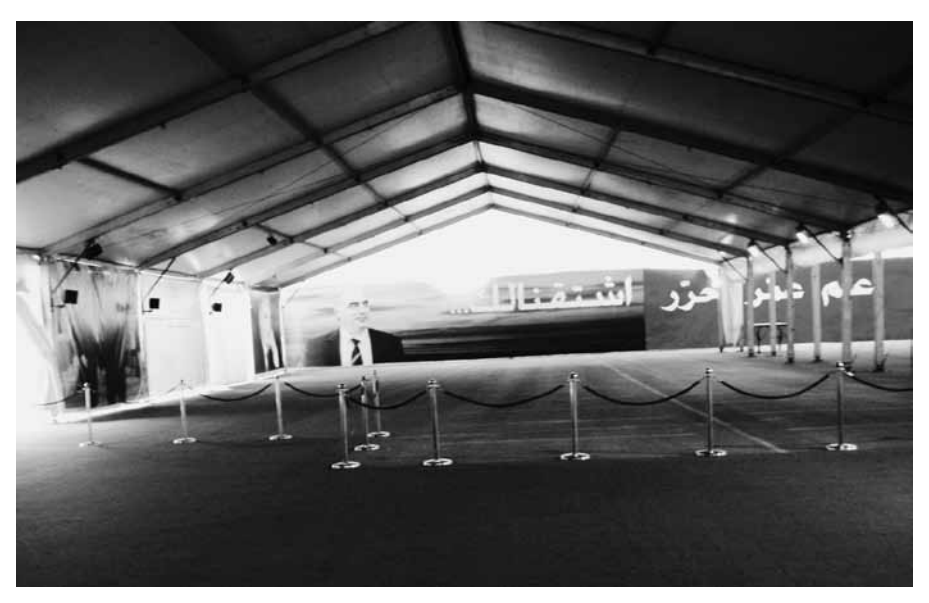
Figure 8.5 A considerable area of the funerary complex has yet to be developed (2009).

where the darih served as a formidable forum and an instrument of political mobilisation in a context of heightened communal polarisation in Lebanon.