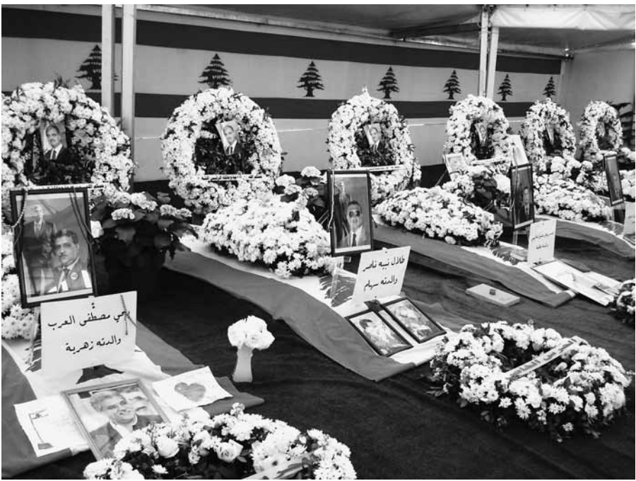
Figure 8:3 The tombs of Hariri's seven bodyguards in April 2005 (upper) and April 2006 (lower).