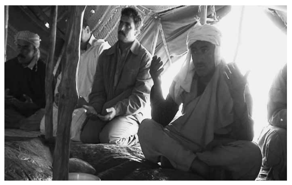
Figure 5.4 Concentration during the recitation of the Qur'anic verse.

The verse's recitation is distinct from the one of du'a, invocations and thanks. Indeed, during this second sequence, people are more responsive. They put their