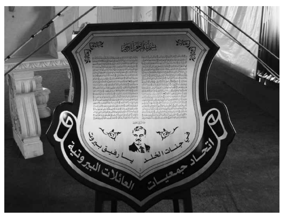
Figure 8.4 Shield with Quranic verse, a gift from Beiruti families to "Rafiq of Beirut" (2009).

eventually culminated, first, in a sit-in protest that lasted for eighteen months and then, in May 2008, in the violent takeover of Sunni parts of Beirut by Shi'i militias.<sup>18</sup>