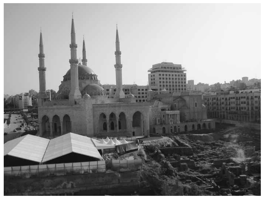
Figure 8.1 An overview of Hariri's grave-site (under the white shelters) bordering Martyrs' Square, the Muhammad al-Amin mosque, the Maronite cathedral of St George and the Garden of Forgiveness (under development) in 2006.

of Hariri, children's drawings, tributes, wreaths and copies of the surat al-fatiha . One also discerned candles with pictures of Mar Charbel (a Catholic monk venerated as a saint by many Lebanese Maronites) or the Virgin Mary.