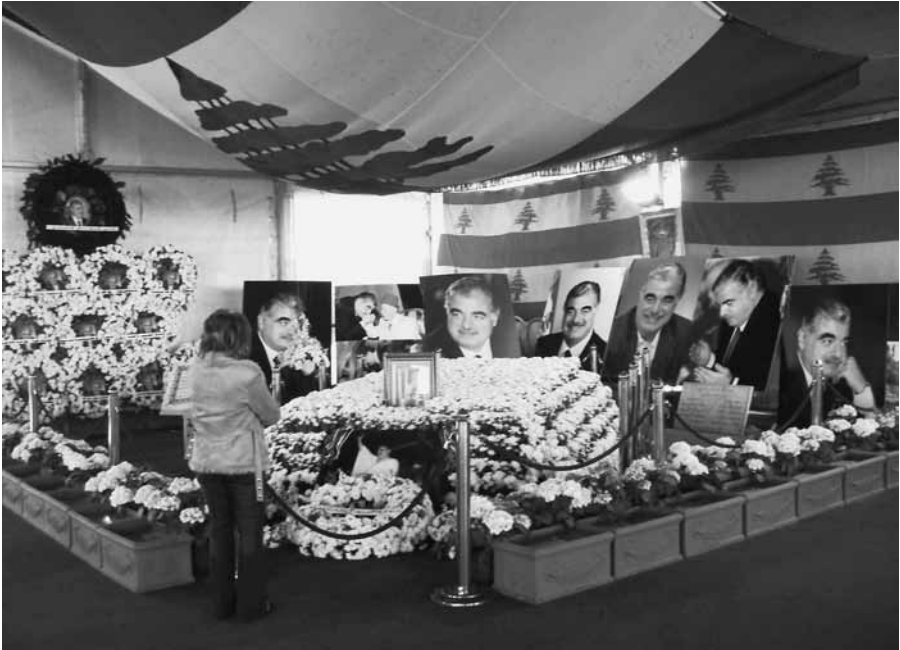
Figure 8.2 Hariri's tomb in April 2005 (upper) and April 2006 (lower).