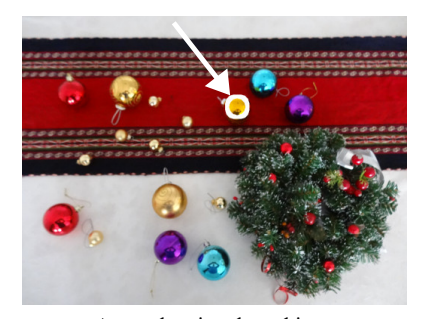
A template is selected in a high-contrast image.