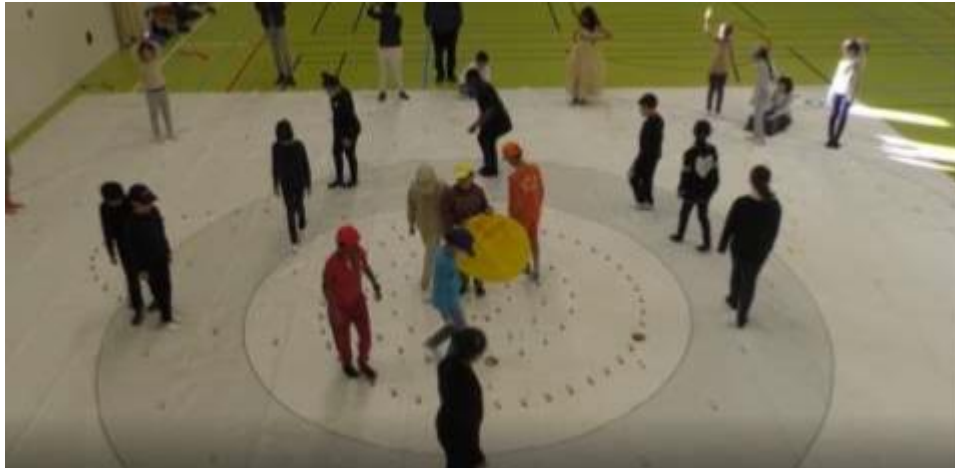
Figure 1. The “Human Orrery”: Pupils enact planets (Mercury to Jupiter), asteroids and comets (in black) along their orbits around the Sun