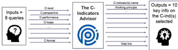
FIGURE 1: THE C-INDICATORS ADVISOR TOOL