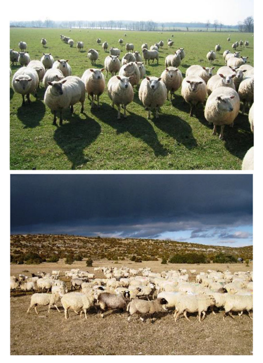
Fig. 1 Various forage-based strategies and sheep breeds to adapt to the diversity of local context in search of high performances. Pictures represent lowland and upland areas.

A preliminary analysis of a database of 1462 farm years (Benoit and Laignel 2011) based on 118 farms, each surveyed on average over 12 years, shows the high variability of two key economic indicators: ewe productivity and concentrate feed requirements. These two variables are good proxies for farm efficiency. Indeed, concentrate feed is the main production cost for sheep farming, representing on average 64% of the operational costs in this group of farms. Ewe productivity is the most correlated indicator to gross margin per ewe, which is the most correlated indicator to farm net income (Benoit and Laignel 2011). This leads us to consider that the ratio