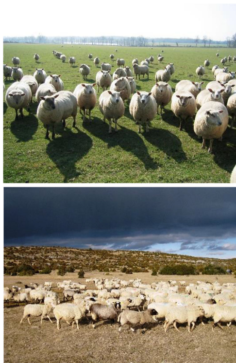
Fig. 1 Various forage-based strategies and sheep breeds to adapt to the diversity of local context in search of high performances. Pictures represent lowland and upland areas.

A preliminary analysis of a database of 1462 farm years (Benoit and Laignel 2011) based on 118 farms, each surveyed on average over 12 years, shows the high variability of two key economic indicators: ewe productivity and concentrate feed requirements. These two variables are good proxies for farm efficiency. Indeed, concentrate feed is the main production cost for sheep farming, representing on average 64% of the operational costs in this group of farms. Ewe productivity is the most correlated indicator to gross margin per ewe, which is the most correlated indicator to farm net income (Benoit and Laignel 2011). This leads us to consider that the ratio