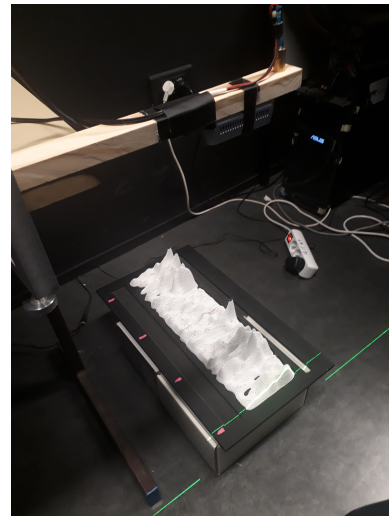
Figure 4: Prototype of our multimedia system.

At present, we only have a relatively rudimentary prototype of this multimedia system (see Figure 4). To better evaluate its relevance, a video accompanies this submission, where the sound is nothing more than a sentence in French: “Pas une personne ne chante comme une autre” (“Not one person sings like another”). The scrolling is done by manually moving the sonagram by hand, making it difficult to control the reading. In the final version, which will be presented at the exhibit, the movement will be controlled by means of a handwheel, hence much more precise. The playful aspect will therefore consist in trying to reproduce the original sound in the most faithful way possible, or on the contrary to deliberately distort it. Of course, any sound signal can be read: if accepted, our multimedia player will be presented in such a way that the user chooses a 3D-sonagram, like a vinyl disc, places it under the interactive playback system, and then “plays” it, as a barrel organ player would do.