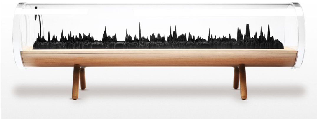
Figure 1: Next Industrial Revolution , a sculpture from Gilles Azzaro [1].

Jean-Denis Durou IRIT, UMR CNRS 5505 University of Toulouse, France