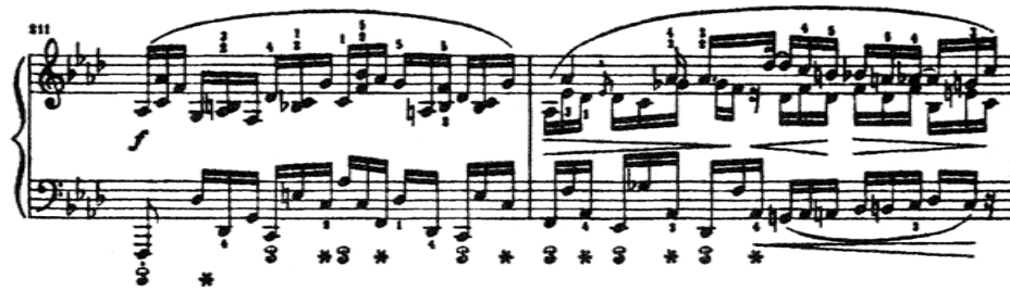
Frédéric CHOPIN, Ballade opus 52. mesure 211-212.

one hand, there are textual, thus automedial, quotations bearing a relationship to music. These may either deal with music as a subject matter or quote some textual part of a musical work (lyrics, libretto, etc.). On the other hand, there are musical quotations proper – allomedial epigraphs – that appear as score insertions. Both imply that the reader be more or less acquainted with music. Allomedial epigraphs naturally demand more prior musical knowledge, since they make use of a different sign system. The above-mentioned Cotroneo's Presto con Fuoco presents the reader with such an allomedial epigraph: